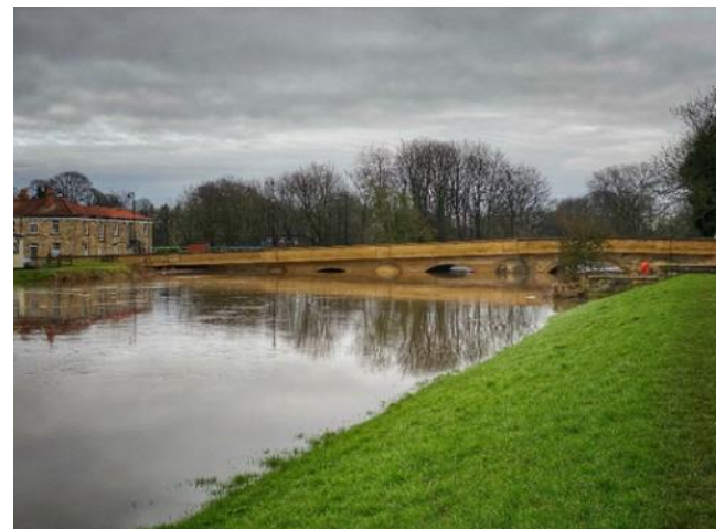
River Wharfe 2020 Tadcaster

Please be assured that we are doing all we can to ensure work continues and that delays caused by the knock-on effects of this pandemic are kept to an absolute minimum.