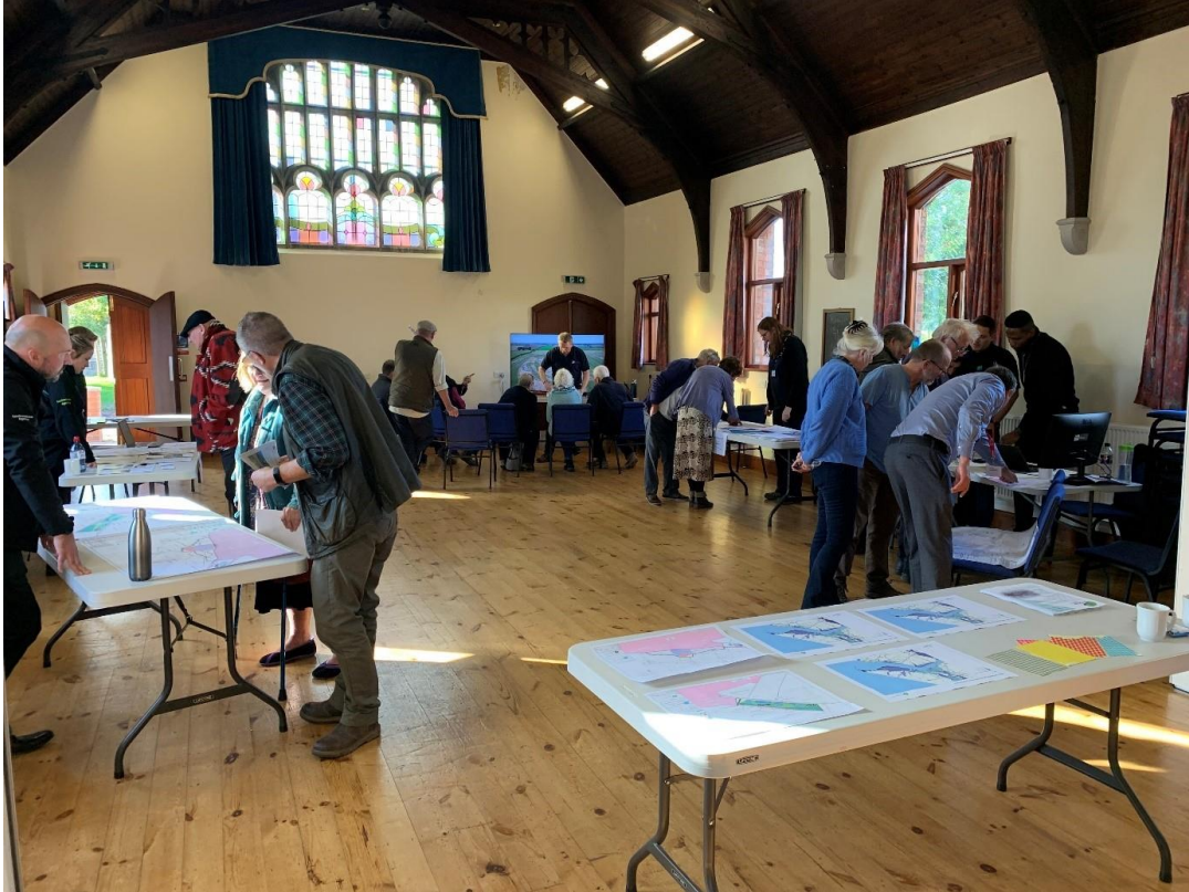
Photo: The drop-in in progress in Welwick village hall in October.

drone footage from a flyover in September to give visitors an aerial view of what's been happening on the site. Over 40 people came to the drop-in and spent time talking with staff about the scheme. Thank you to everyone who called in; it was an interesting event, with lots of questions asked and answered.