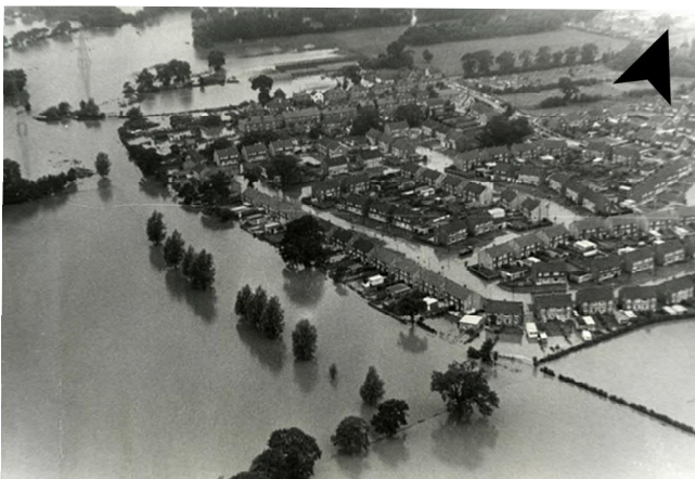
Aerial photo of the 1968 floods

Byfleet has a long history of flooding, with the large September 1968 flood causing significant damage to properties along the River Wey. You can see the extent of the flood in the photograph below.