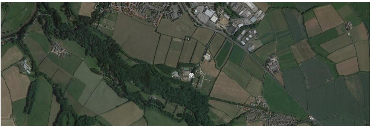
Figure 1 - Site location plan

Whitby WwTW is located on the south-eastern fringes of Whitby. The site is surrounded by the Stainsacre Beck to the south, the A171 to the north, farmland to the north and west and residential properties and a caravan park to the east. To the south of the Beck is a wooded area and long-distance path. The closest residential and commercial properties are approximately 60m east, Stainsacre approximately 600m south-east, and the Whitby industrial estate 500m north-east.