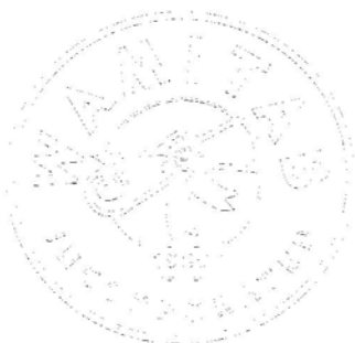
CIWM Chief Executive Officer

This certificate needs to be renewed during the period between 1 March 2014 and 29 February 2015