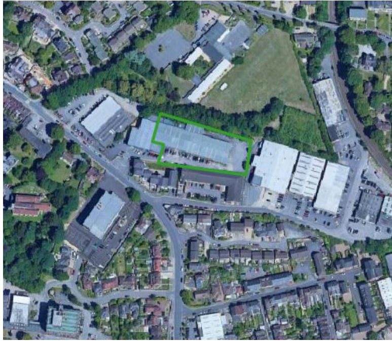
Figure 1 Site Location (Aerial Photo)