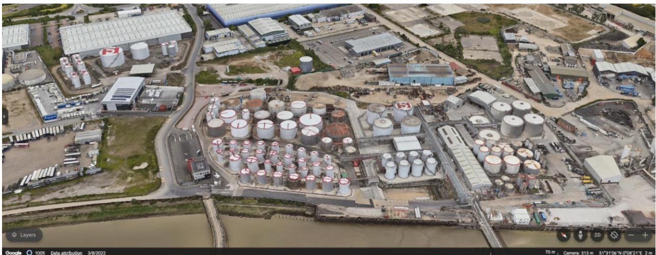
Figure 1: Proposed Site