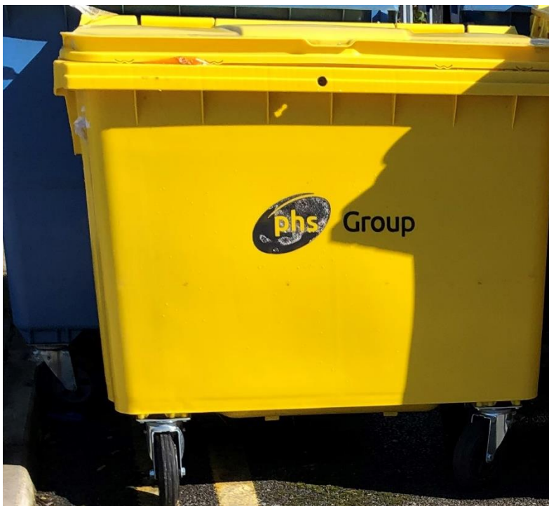
Figure 3.1: Example of sealed bin used for the storage of waste