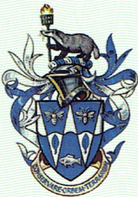
CIWM Chief Executive Officer

The Chartered Institution of Wastes Management