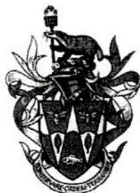
CIWM Chief Executive Officer

The Chartered Institution of Wastes Management