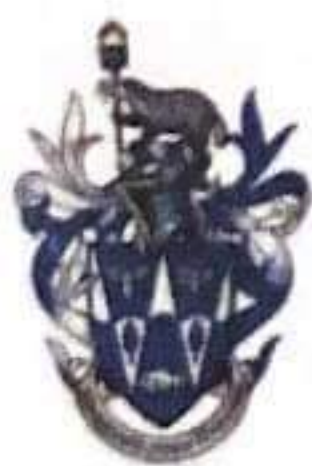
CIWM Chief Executive Officer

The Chartered Institution of Wastes Management