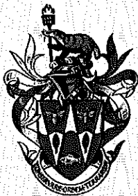
CIWM Chief Executive Officer

The Chartered Institution of Wastes Management