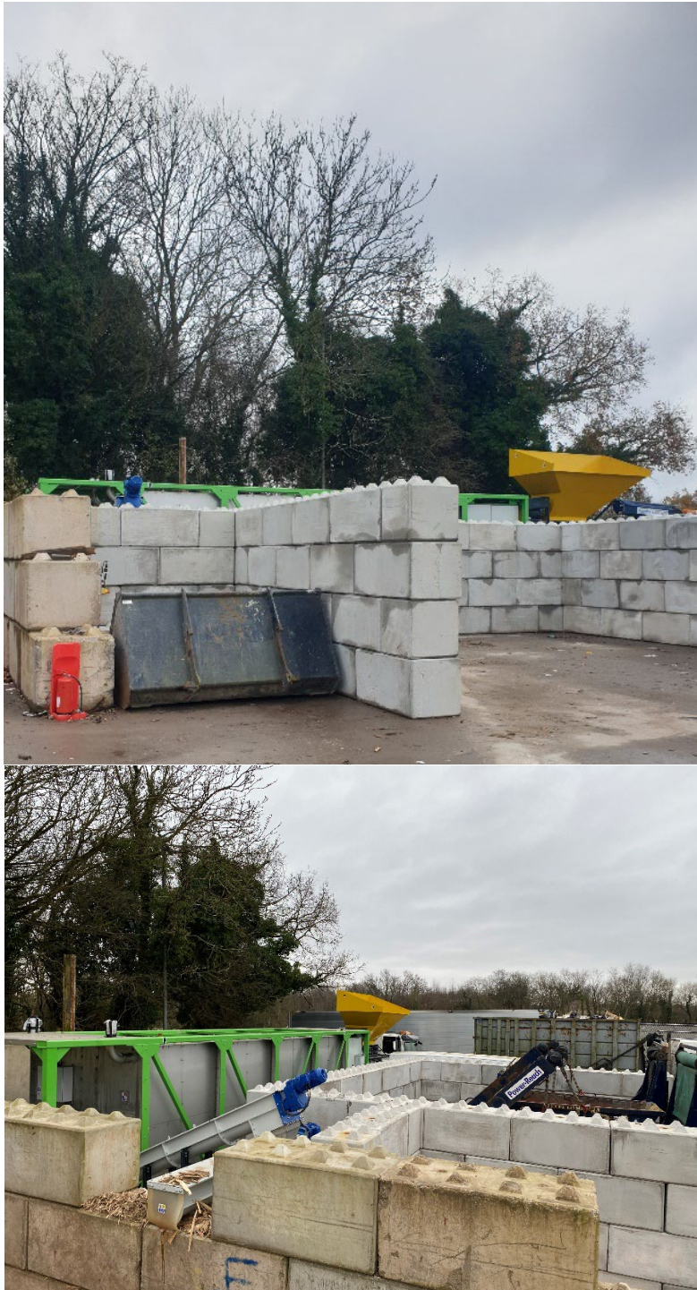
Figure 3 – XO22 in position at Newbury Works, Coleford