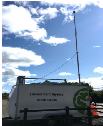
Monitoring air quality

We have installed a mobile monitoring facility at the site to monitor air quality. This is in addition to the operator's monitoring. Results will be shared on the Citizen Space webpage.