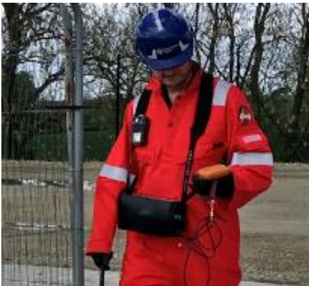
Site walkover, monitoring for methane

Hydraulic fracturing is set to start at Third Energy's Kirby Misperton site in the coming weeks. The Environment Agency (EA) will be active in regulating the site during operations and will provide you with updates of our work.