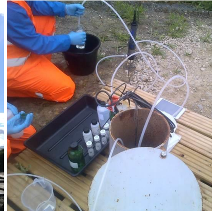
Water quality sampling