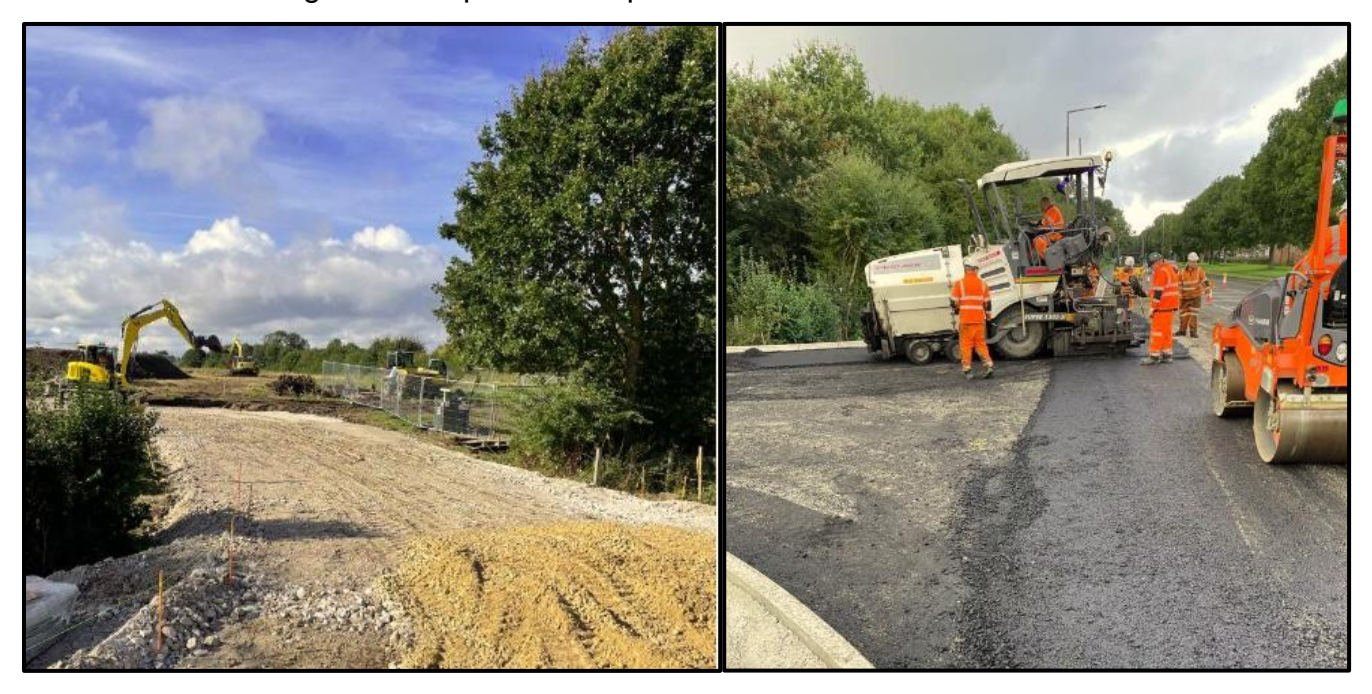
Surfacing work in the cornfield and tarmacking the compound entrance off Shipton Road

Work started last month on setting up a site compound for our contractors, BAM Nuttall. The first stage has been to create an entrance to the cornfield off Shipton Road and then surface the area to allow heavy vehicles to use it. The compound will remain in place until the scheme is completed in late 2023. After this, the cornfield will be reinstated and the topsoil that was stripped off it before work began will be put back in place.