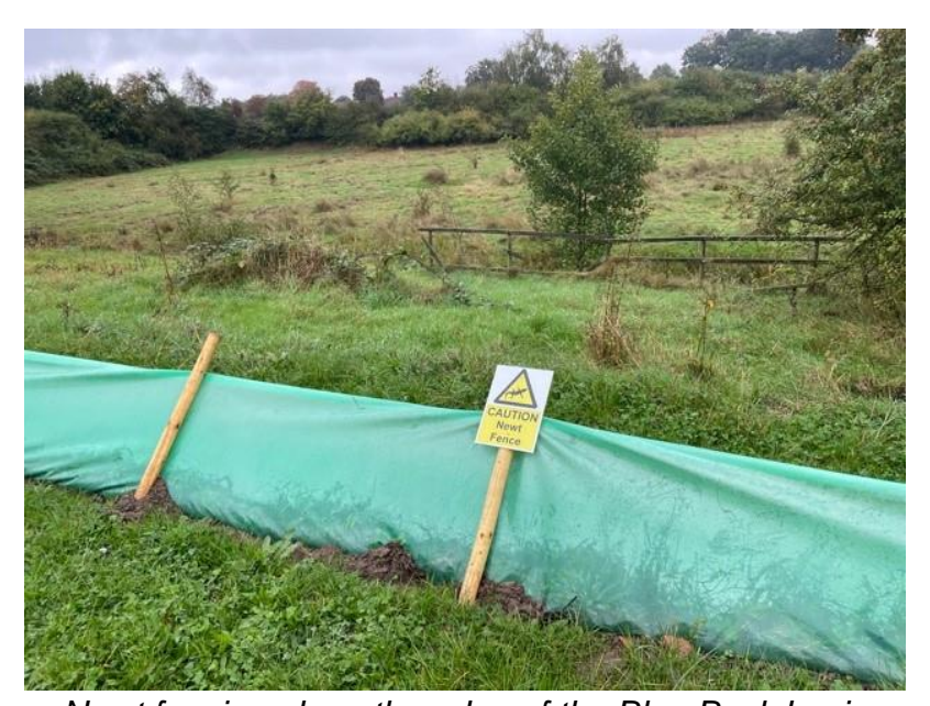
Newt fencing along the edge of the Blue Beck basin

Before starting work in the cornfield, a team of ecologists carried out a comprehensive survey to check for and remove any great crested newts found on site. We also installed a stretch of green plastic fencing around the Blue Beck basin to contain the newts in a safe, undisturbed area; the fencing slopes gently into the basin, meaning that any newts inside it cannot get out but newts on the other side (where construction vehicles will be passing) can climb up the fence posts and escape into the basin. This will also be kept in place until construction is finished.