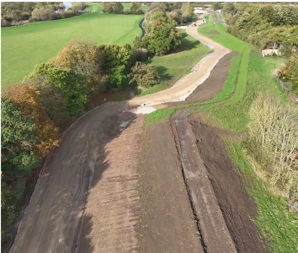
Photo: Raising the height of the embankment near Homestead Park (October 2022)

How we're reducing the risk of flooding for York