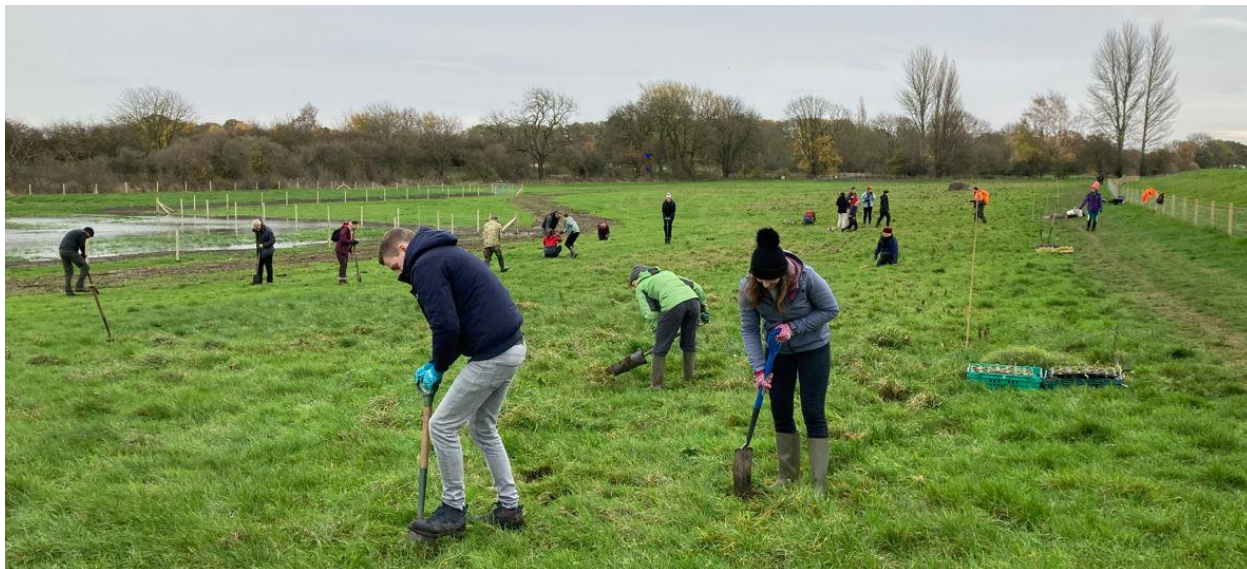
Photo: volunteers planting 'plugs' to create new areas of meadow grassland habitat.

In November last year we organised two days of 'plug planting', inviting volunteers to help us create a new area of meadow grassland on the Ings. We got an amazing response to this request and so would like to thank everyone who took part. Over 40 volunteers braved cold and wintry weather to come out and plant around 4,000 'plugs' (seedlings) of rare meadow grassland species such as Great Burnett, Ragged Robin and Common Bistort. Once established, these will add flashes of colour to the meadows and restore 12 hectares of meadow grass land habitat. Special thanks are also due to the experts from the Floodplain Meadows Partnership who advised us on the process, Brunswick Nursery for growing the thousands of plants from seed (and for bringing delicious cakes), and to Friends of St Nick's for leading the activity on the day.