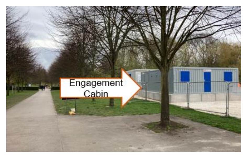
Figure 2 - The Environment Agency's engagement cabin (photo taken prior to ramp being installed)