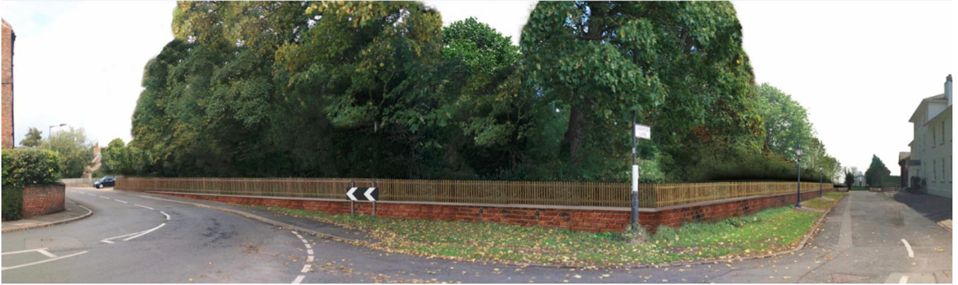
Figure 2 - wide-angle illustration of the new flood wall, running along Chantry Lane and Bishopthorpe Road

Once the site compound is completed, work will begin to construct the flood defences on Chantry Lane. The scheme will include the construction of an approximately 180 metre-long flood wall bordering The Dell (Figure 2), with a 6 metre-deep steel barrier underground; a flood gate across the bottom of Chantry Lane; and a new manhole chamber with a penstock mechanism (essentially alterations to the existing Yorkshire Water drainage system).