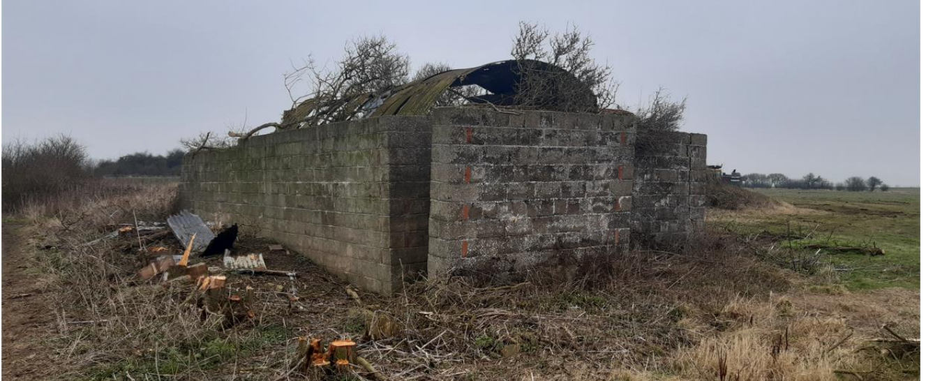
The ruins of the Nissen hut at the bottom of Humber Lane. This is due to be demolished in the spring of this year.