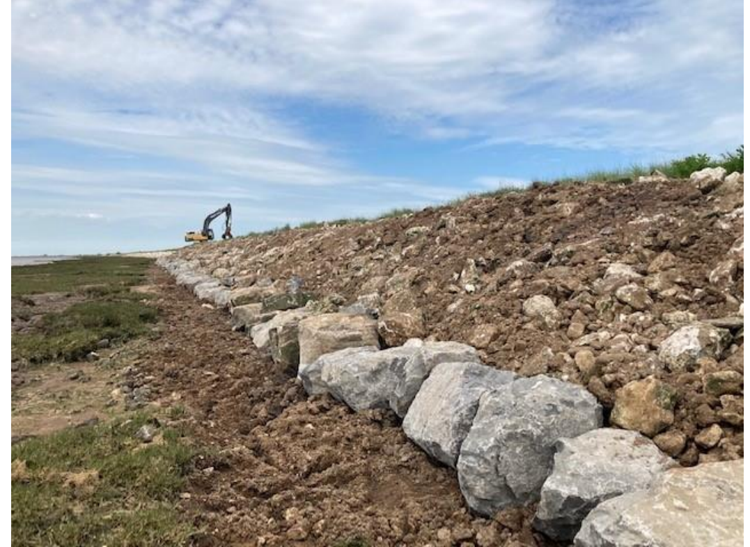
Repairs being made to the embankment between Skeffling and Easington