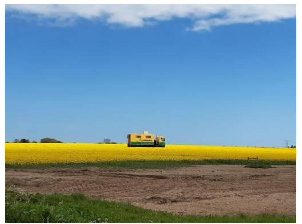
A ground investigation rig working along the line of the new embankment

Throughout June they have also been conducting ground investigations along the line of the new embankment and carrying out additional survey work in the centre of the planned realignment area.