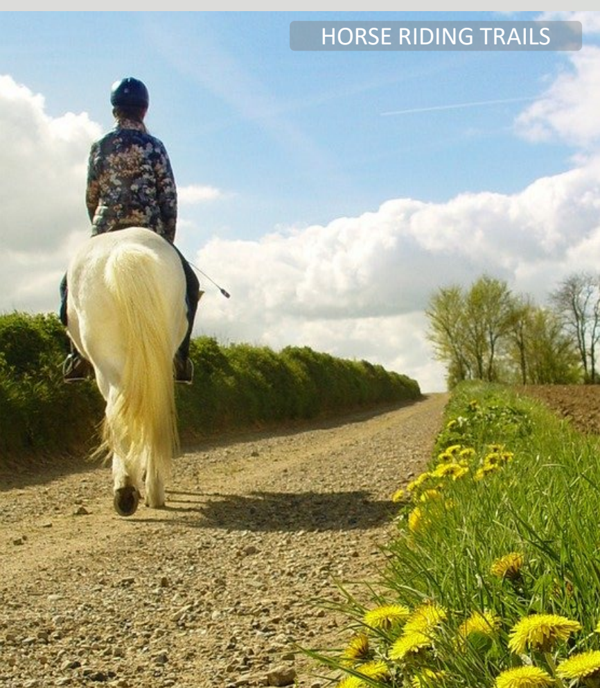
HORSE RIDING TRAILS