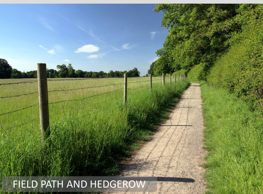
FIELD PATH AND HEDGEROW