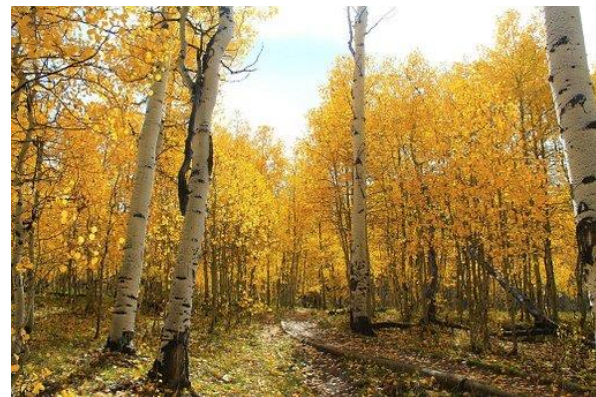
Trees will be planted in some parts of the site to create woodland habitat

Or you can phone our National Customer Contact Centre on 03708 506 506 and ask to speak to a member of the Holderness Drain project team.