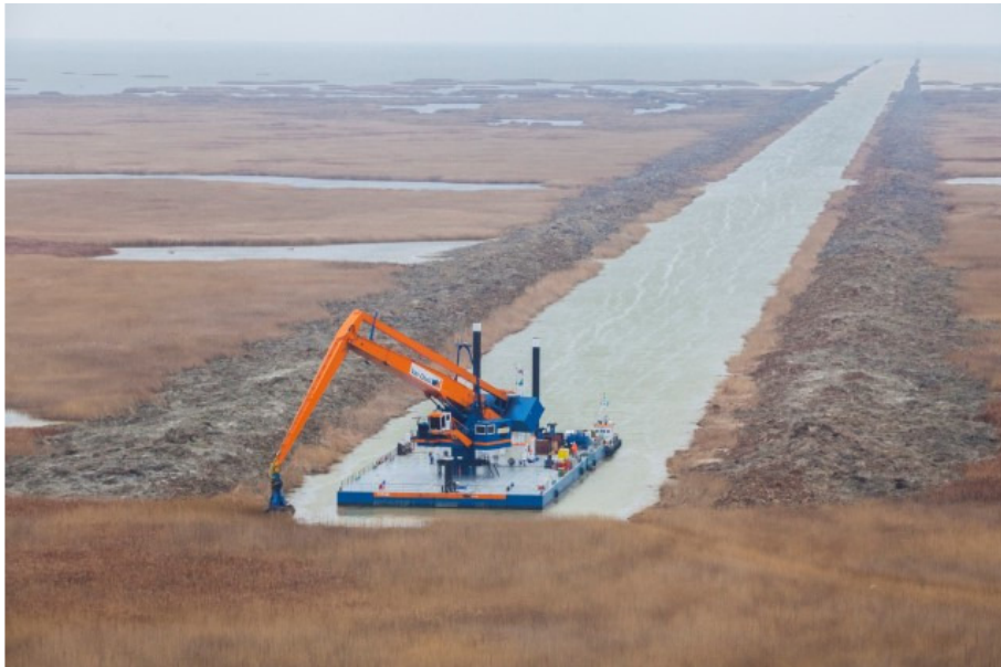
Figure 2-2 – Channel formation using dredging

Whilst the water table in the Oxford area is relatively high the size of the lower section of the channel is not sufficiently large to accommodate a floating work barge and the second stage, upper section of the channel is above the water table. Therefore, dredging type excavation has been discounted for this scheme.