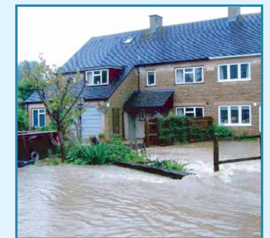
Flooding at The Heath 2007

These field corner areas now support wildflower grasses and wetland habitats.