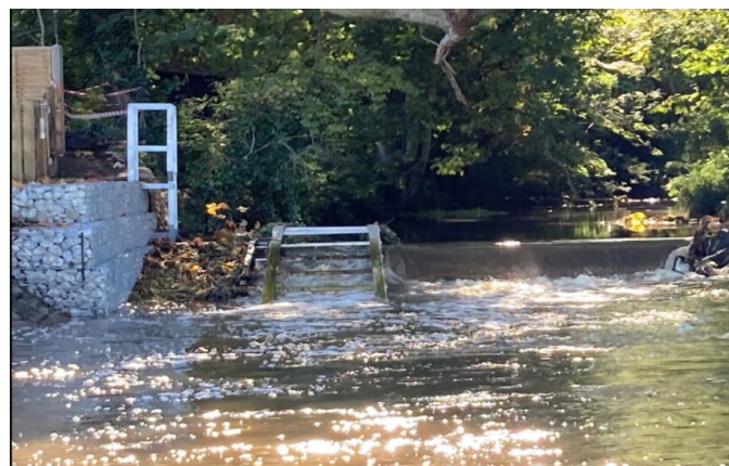
Fish and eel pass on River Wey, Thames confluence