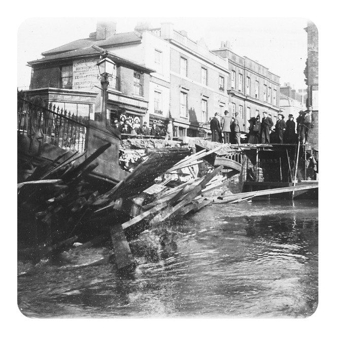
A bridge in the town centre collapsed during flooding in 1900