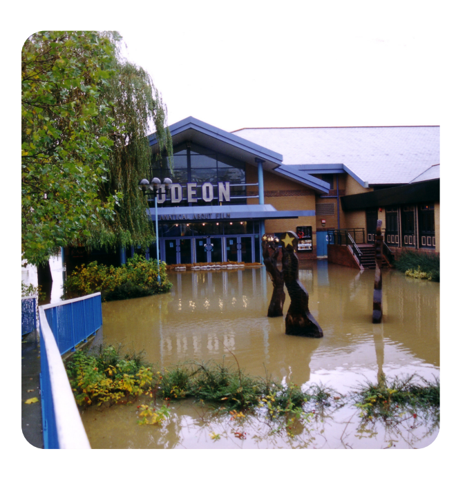
Flooding in 2013 caused impacts to recreational facilities including the Odeon cinema