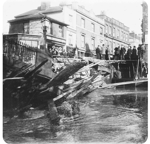
A bridge in the town centre collapsed during flooding in 1900

At the event, we presented pictures of historic flooding in Guildford, and showed how, with climate change, these events are likely to occur more often. We explained how a flood defence scheme in the town centre could reduce the impacts of floods into the future and gave visitors the opportunity to complete a survey giving their views about a potential flood scheme.