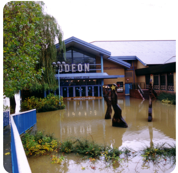
Flooding in 2013 caused impacts to recreational facilities including the Odeon cinema