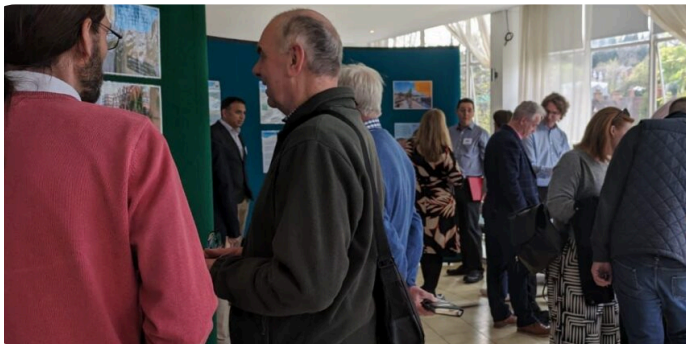
Attendees were able to view information boards and ask questions about the scheme