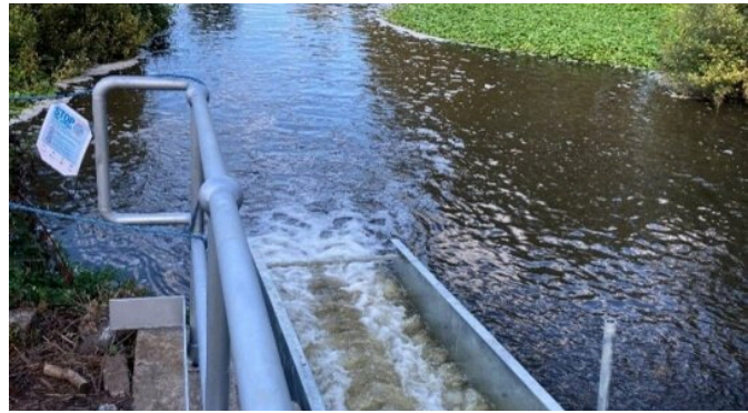
Buckfast Abbey fish pass, River Dart, South Devon

Fish passes allow fish to safely navigate through structures such as weirs, enabling them to move freely throughout the river to breed, feed and find refuge. Naturalistic type fish passes also enhance the river by providing lengths of high-quality habitat.