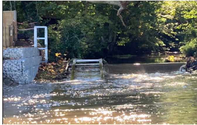
Fish and eel pass on River Wey, Thames confluence