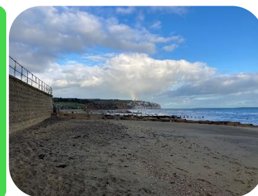
Yaverland sea wall and groyne.