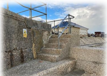
Ageing sea wall at Yaverland.