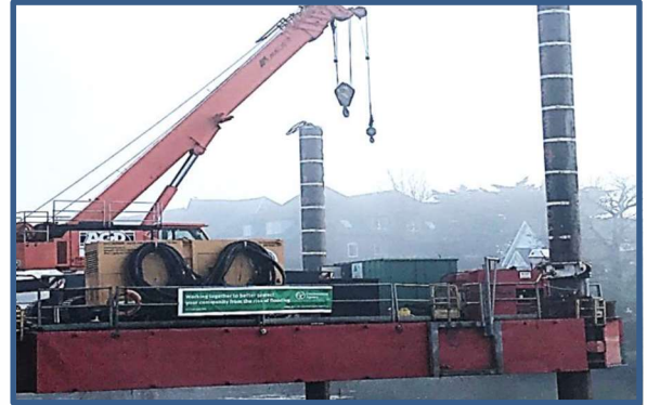
The jack-up barge in Arundel during Phase 1.

We will be working with our partners VolkerStevin to deliver a similar construction process to the last phase of work at River Road. A jack-up barge will be placed in the river which will be used to construct the new sheet pile wall. This will be supported by a moveable pontoon in the river and construction traffic which will deliver materials to the barge.