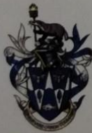
CIWM Chief Executive Officer

The Chartered Institution of Wastes Management