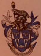
CIWM Executive Director

The Chartered Institution of Wastes Management