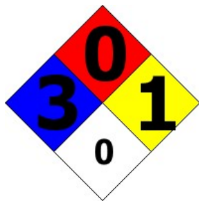
NFPA SCALE (0-4)