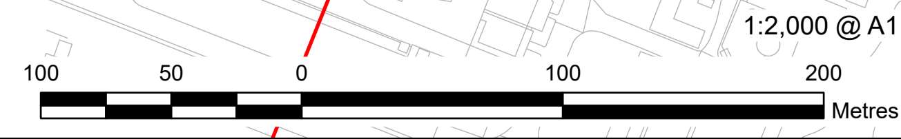
FIGURE NUMBER Figure 4

This drawing has been prepared for the use of AECOM's client. It may not be used, modified, reproduced or relied upon by third parties, except as agreed by AECOM or as required by law. AECOM accepts no responsibility, and denies any liability whatsoever, to any party that uses or relies on this drawing without AECOM's express written consent. Do not scale this document. All measurements must be obtained from the stated dimensions.