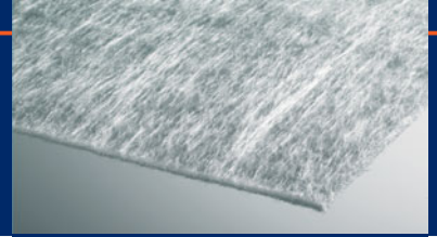
TenCate Polyfelt TS

TenCate Polyfelt TS geotextiles are mechanically bonded continuous filament nonwovens made from 100% UV stabilized polypropylene. They have been used for decades as separation and filtration elements in a large number of civil engineering applications.