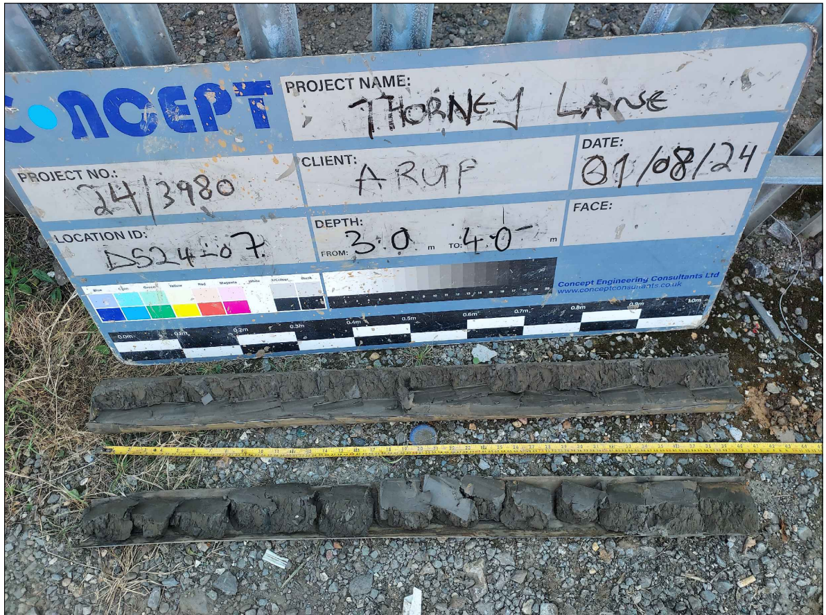
Photograph No 055