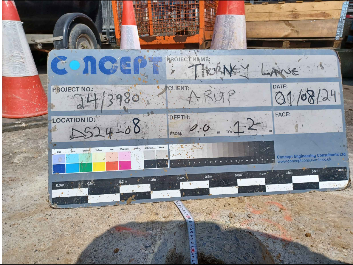
Photograph No 058