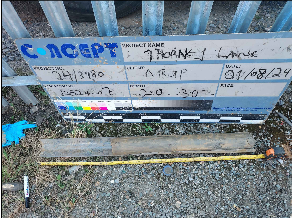
Photograph No 052