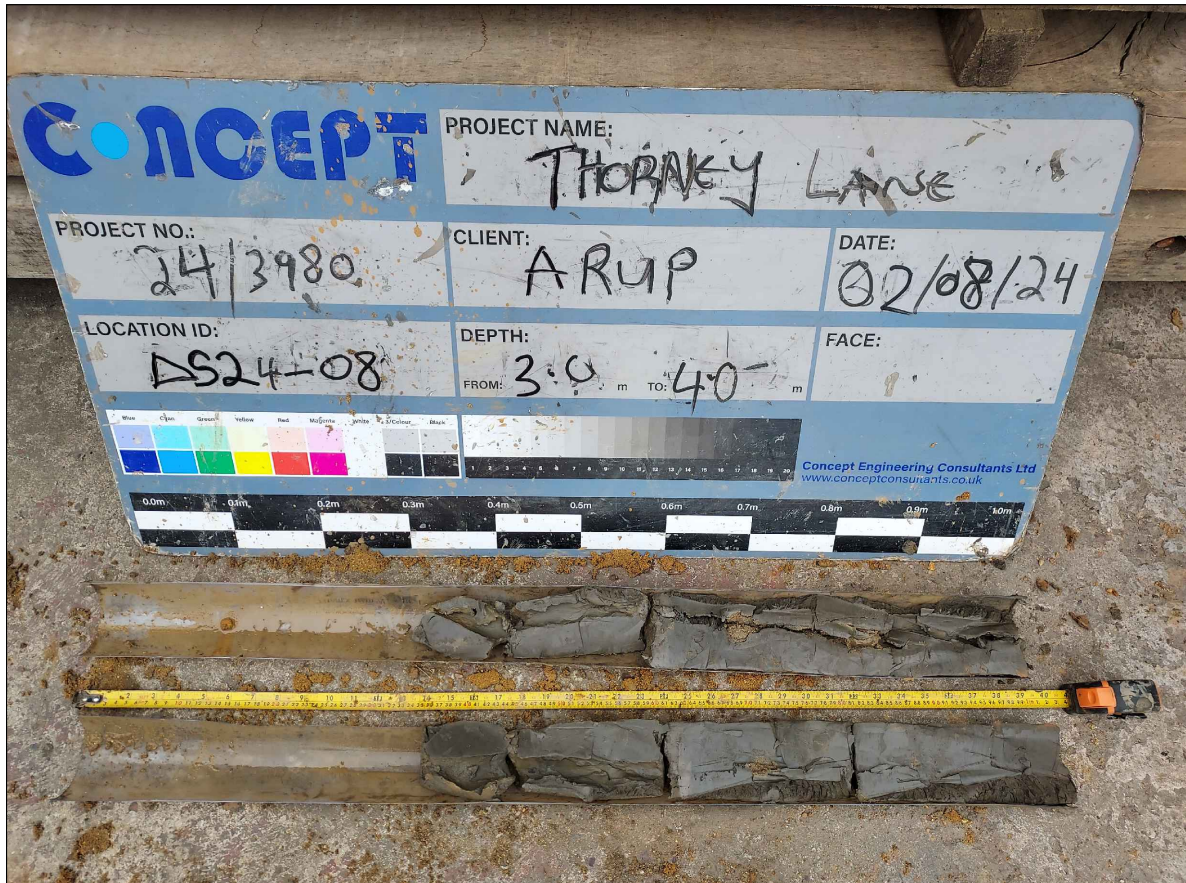
Photograph No 065