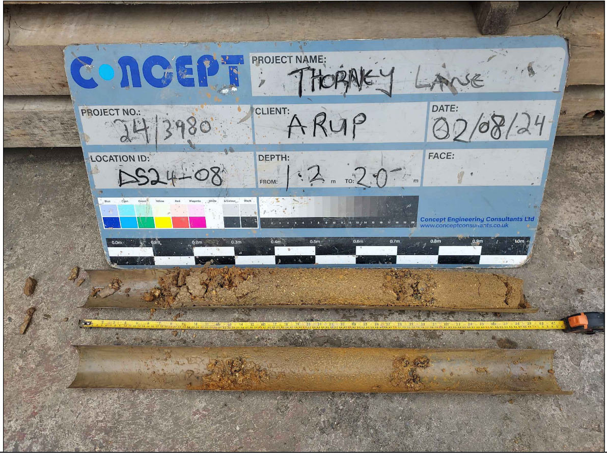
Photograph No 060