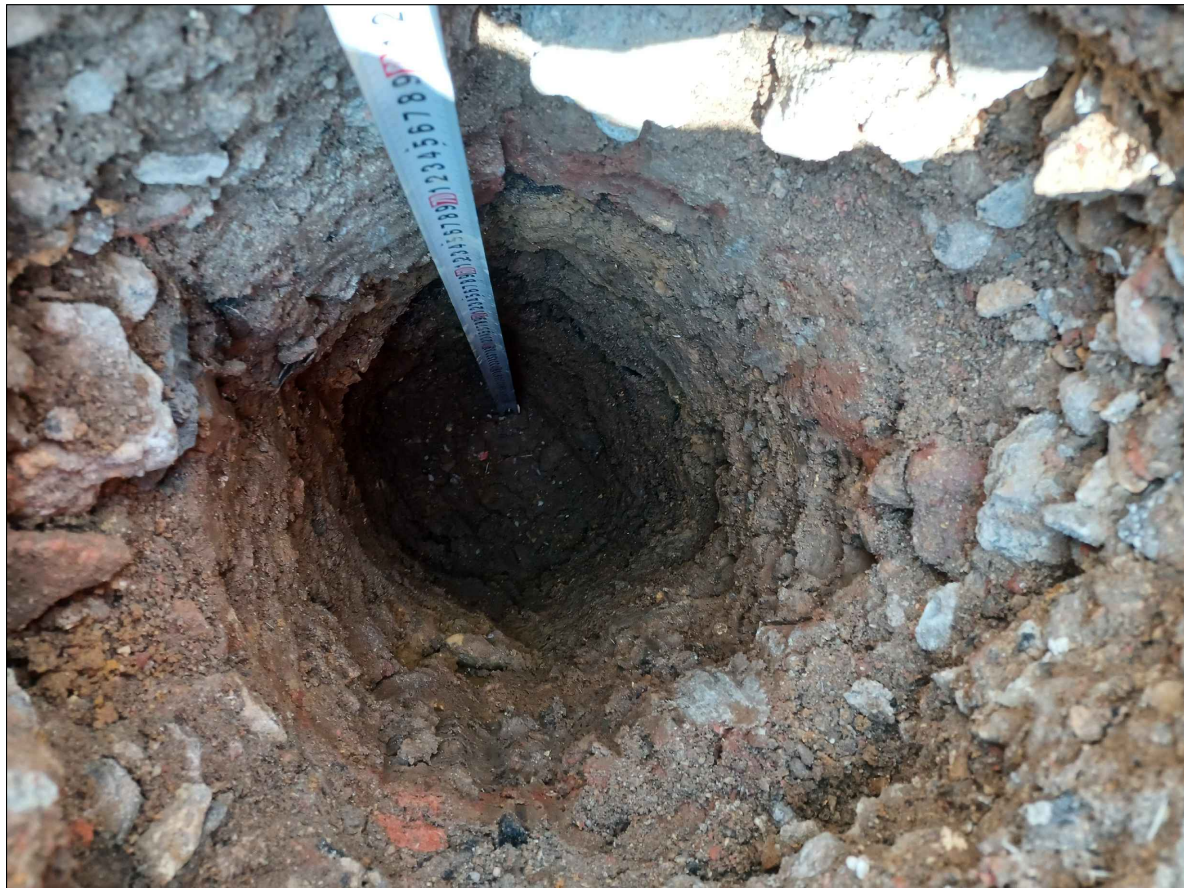
Photograph No 059