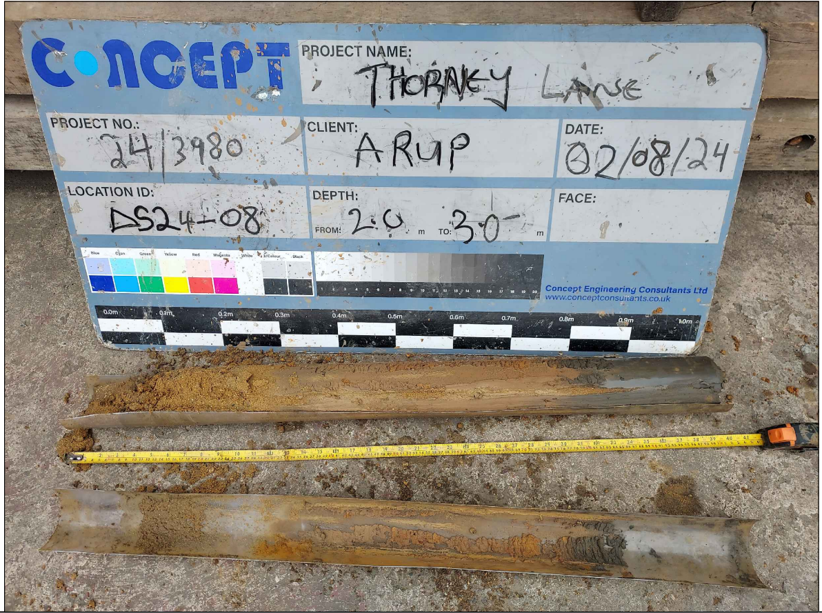
Photograph No 062