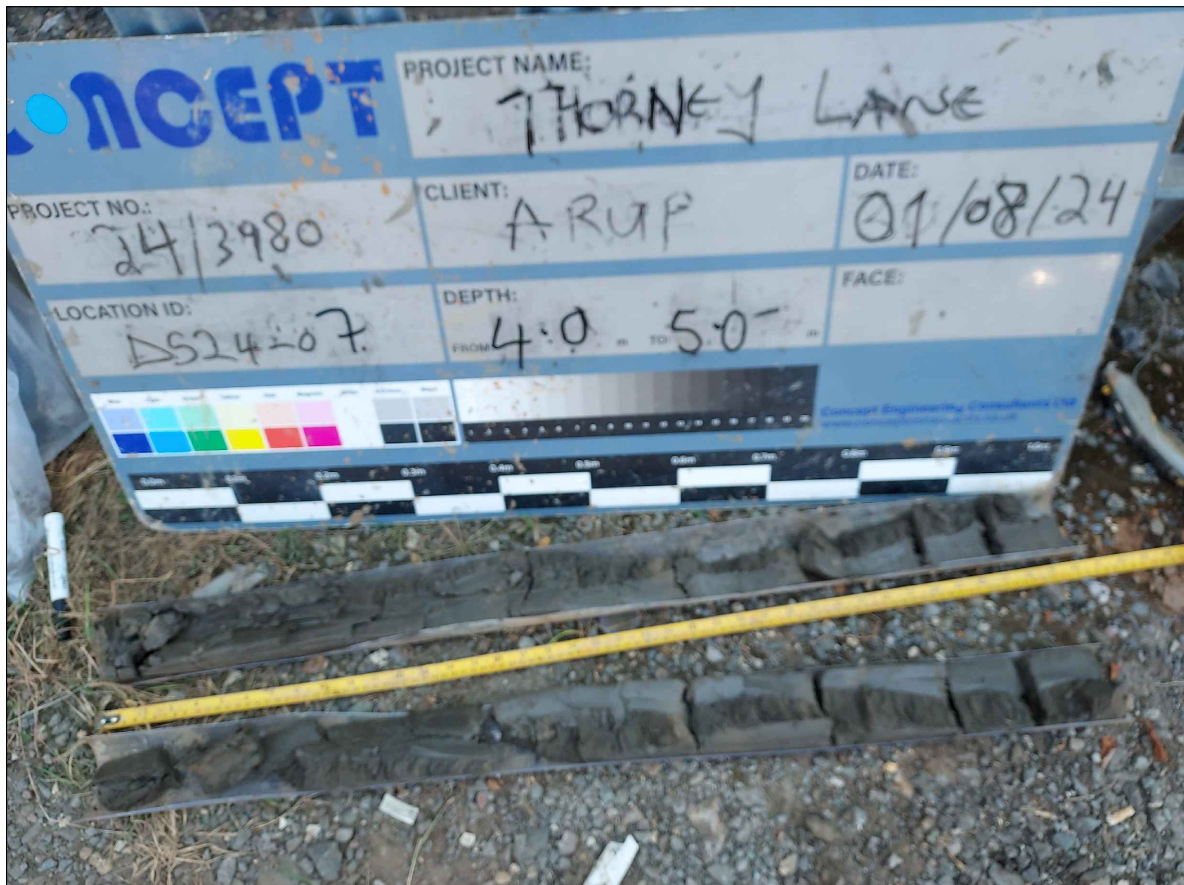
Photograph No 057