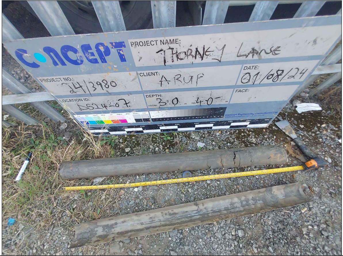
Photograph No 054