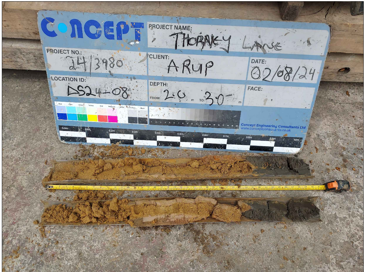
Photograph No 063