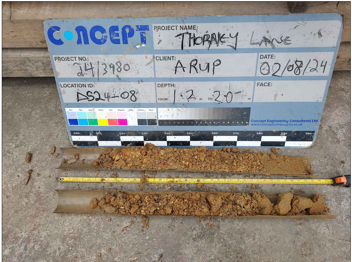
Photograph No 061