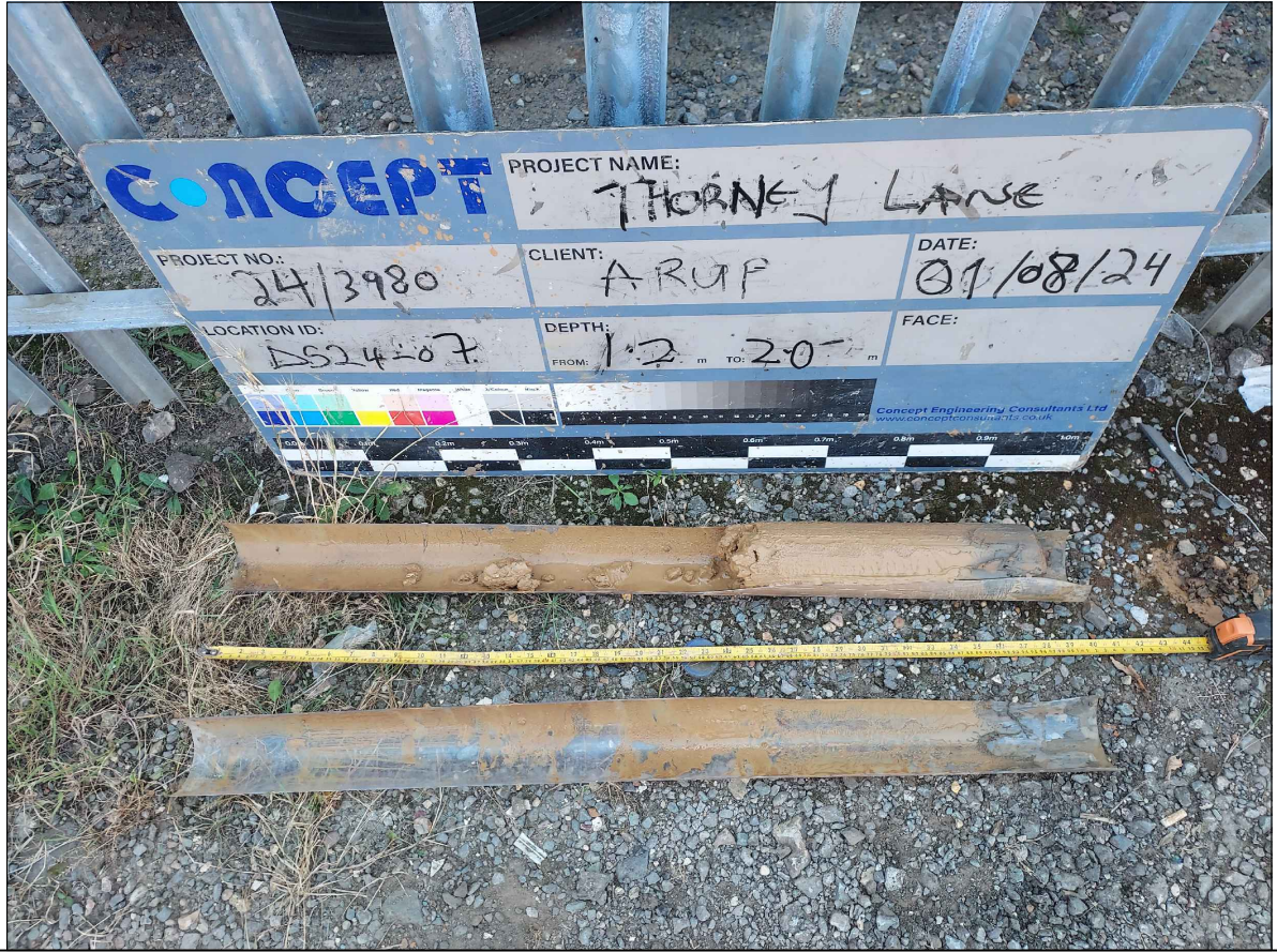
Photograph No 051