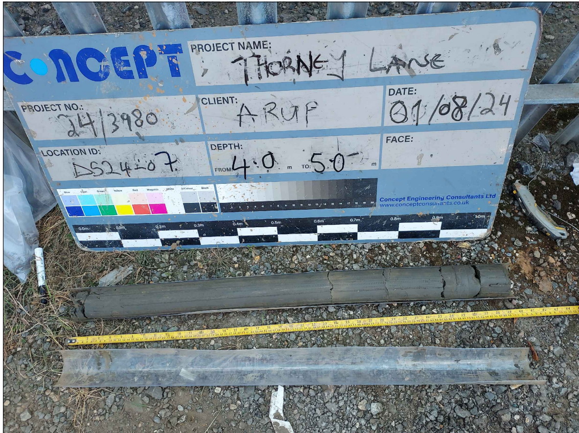
Photograph No 056