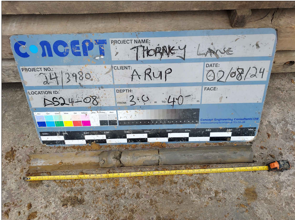
Photograph No 064

HEAD OFFICE: 218 Northfields Avenue London W13 9SJ t: +44(0) 20 8811 2800 e: info@conceptconsultants.co.uk LABORATORY: 47-49 Brunel Road Old Oak Common Acton London W3 7XR t: +44(0) 20 8811 2800 e: lab@conceptconsultants.co.uk MIDLANDS OFFICE: Unit D Herford Way Briery Industrial Estate Coventry CV3 2RQ t: +44(0) 24 7768 7270 e: coventry@conceptconsultants.co.uk