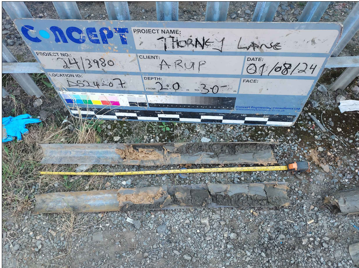
Photograph No 053