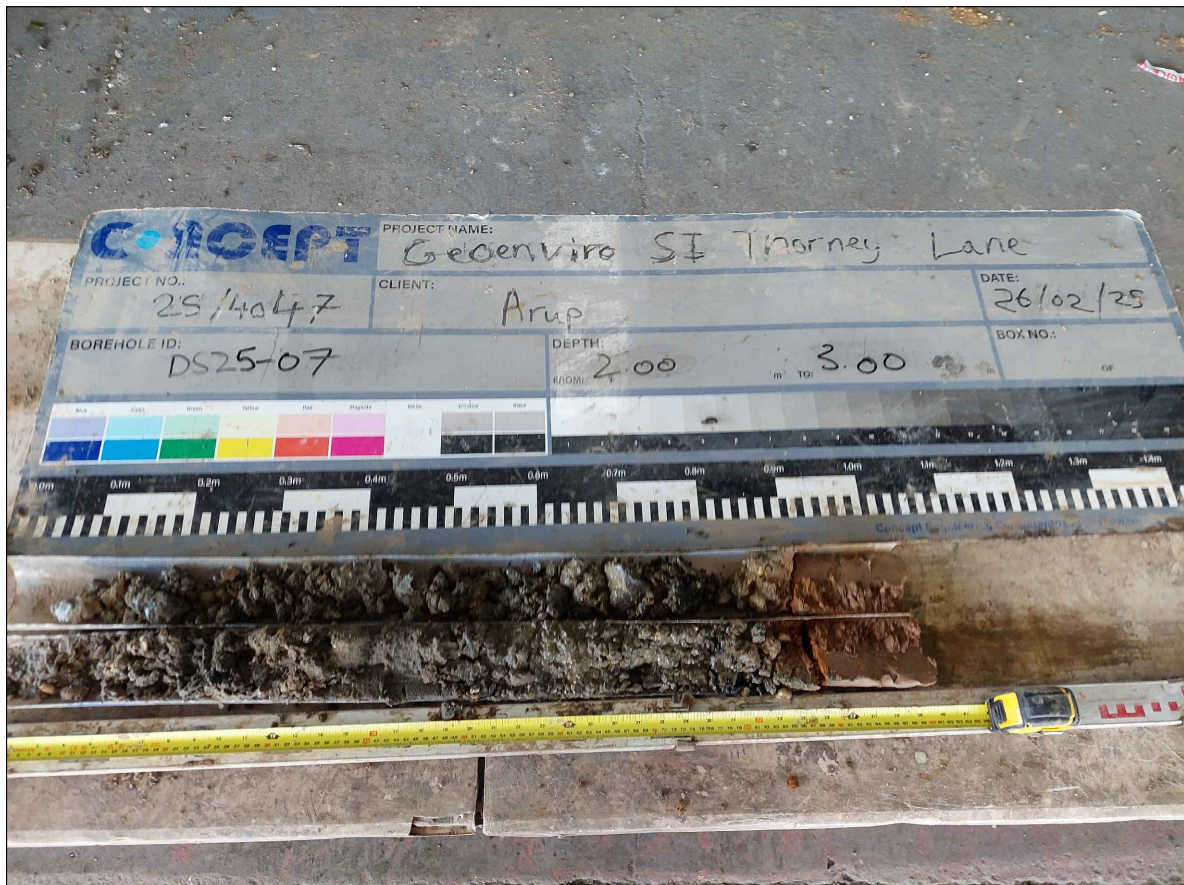
Photograph No 074