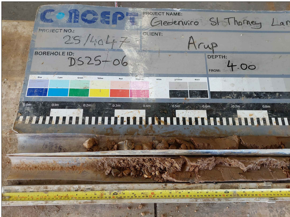
Photograph No 065