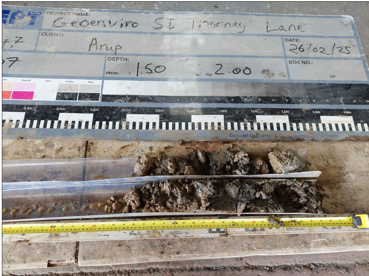
Photograph No 072