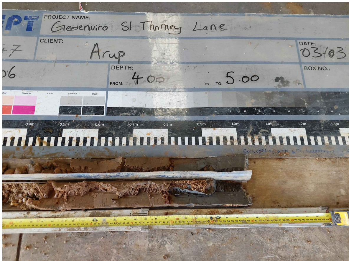
Photograph No 067