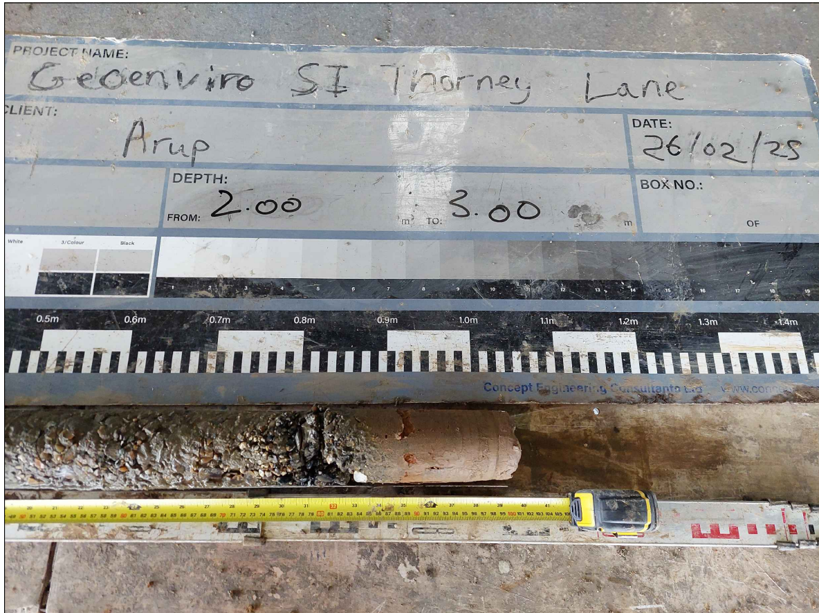
Photograph No 073

MIDLANDS OFFICE: Unit D Herold Way Binley Industrial Estate Coventry CV3 2SD coventry@conceptconsultants.co.uk +44(0) 24 7708 7070