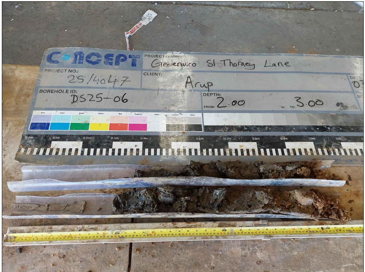
Photograph No 061