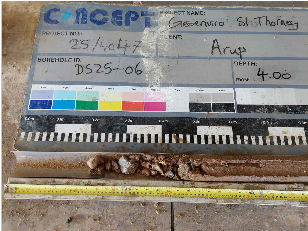
Photograph No 064

MIDLANDS OFFICE: Unit D Herold Way Brimley Industrial Estate Coventry CV3 2SD coventry@conceptconsultants.co.uk +44(0) 24 7708 7070