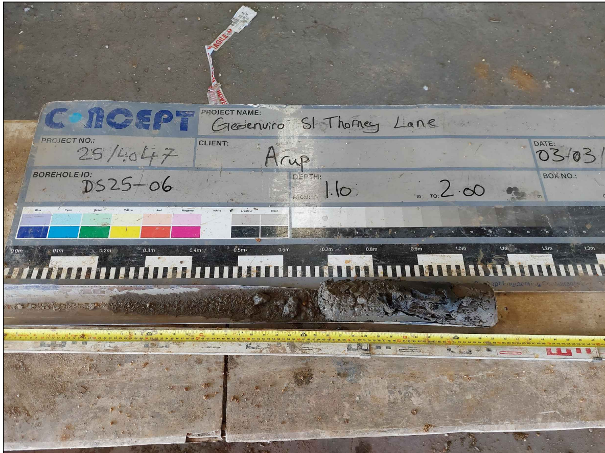
Photograph No 058

MIDLANDS OFFICE: Unit D Herold Way Briery Hill Estate Coventry CV3 2SD coventry@conceptconsultants.co.uk +44(0) 24 7708 7070