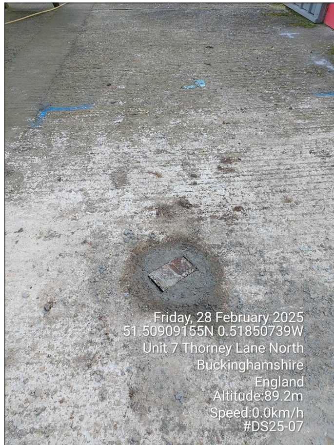
Photograph No 075

MIDLANDS OFFICE: Unit 10 Helled Way Elnley Industrial Estate Coventry CV5 2JG coventry@conceptconsultants.co.uk +44(0)24 7708 7670