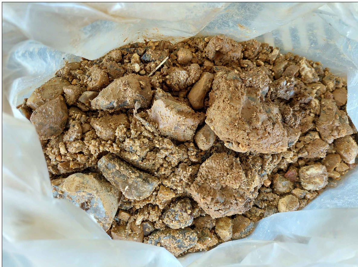
Photograph No 063