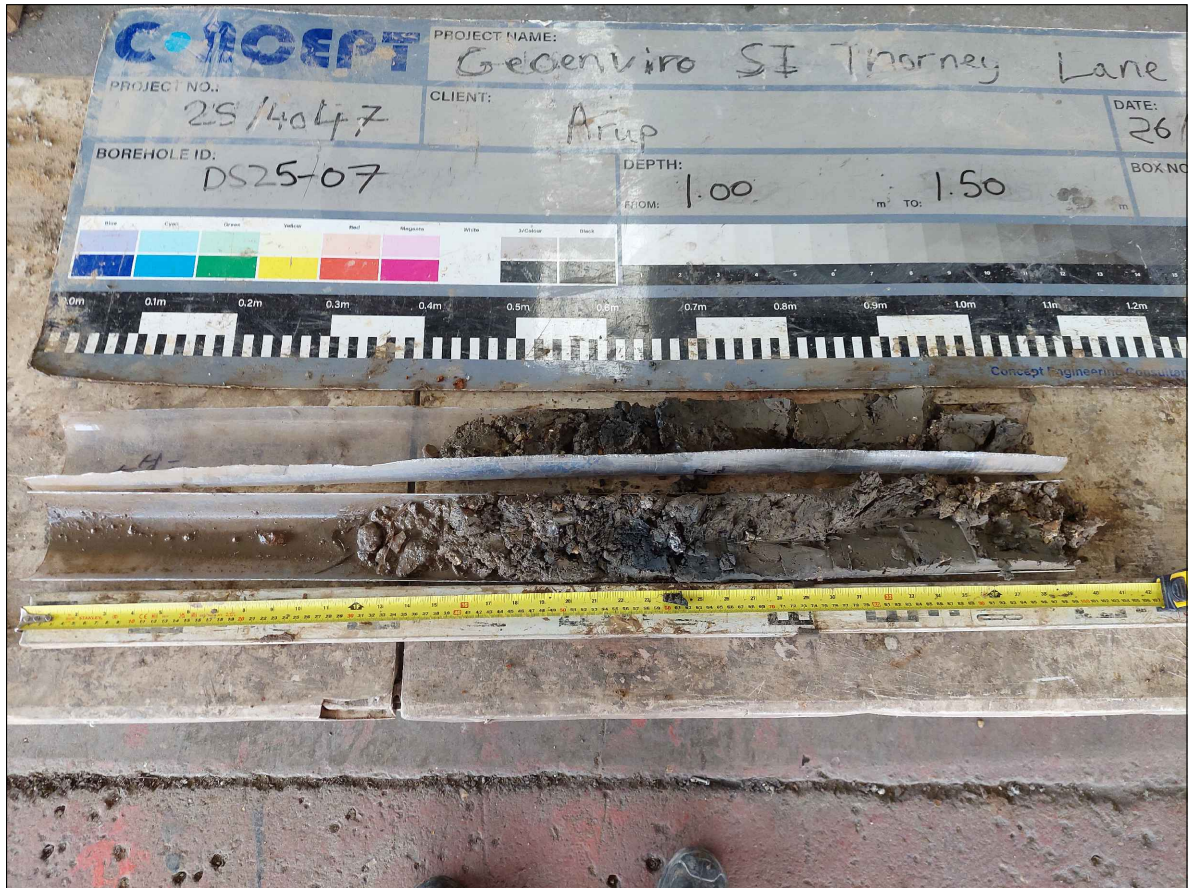
Photograph No 070