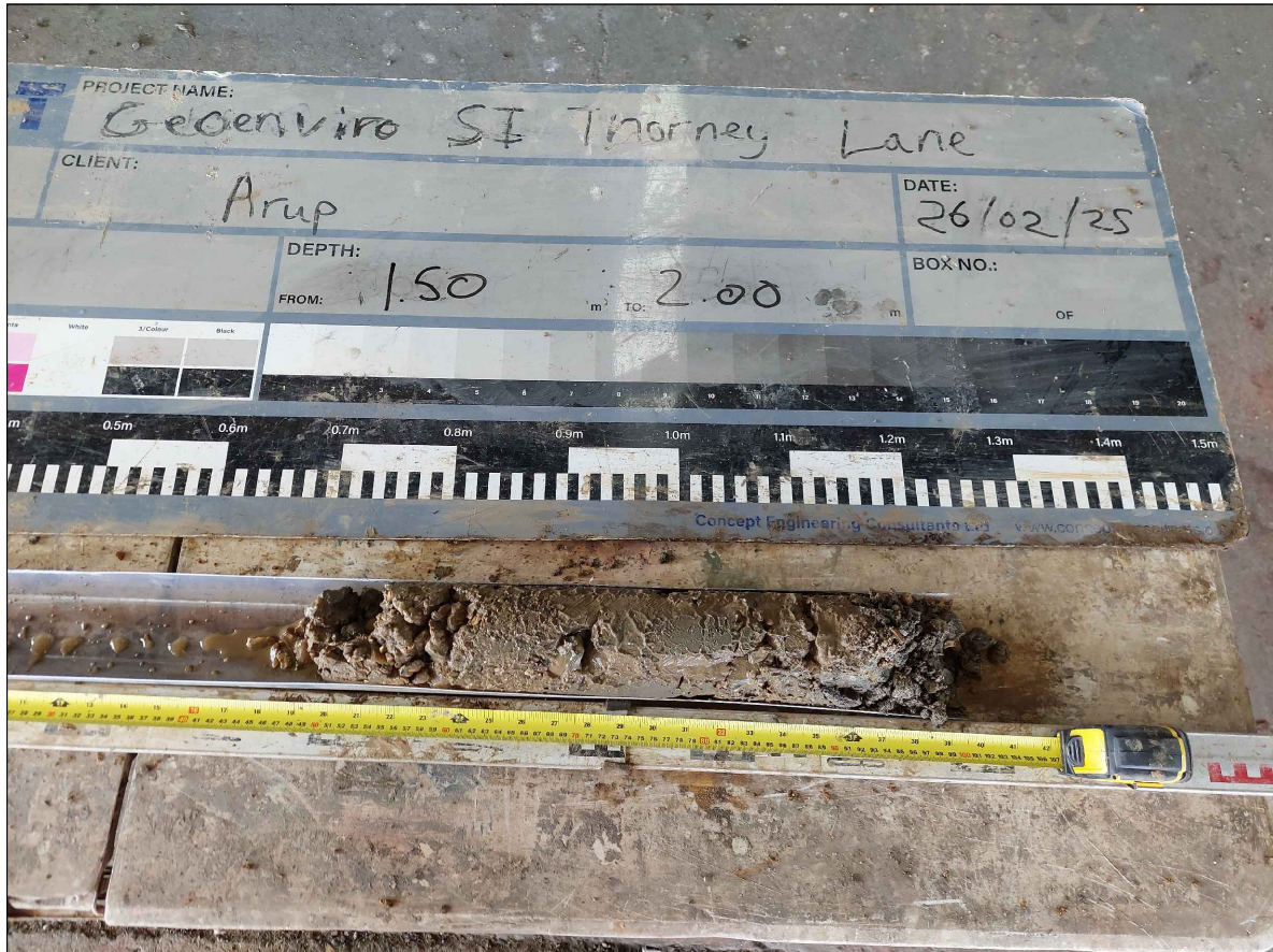
Photograph No 071

MIDLANDS OFFICE: Unit D Herold Way Briery Hill Estate Coventry CV3 2SD coventry@conceptconsultants.co.uk +44(0) 24 7708 7070