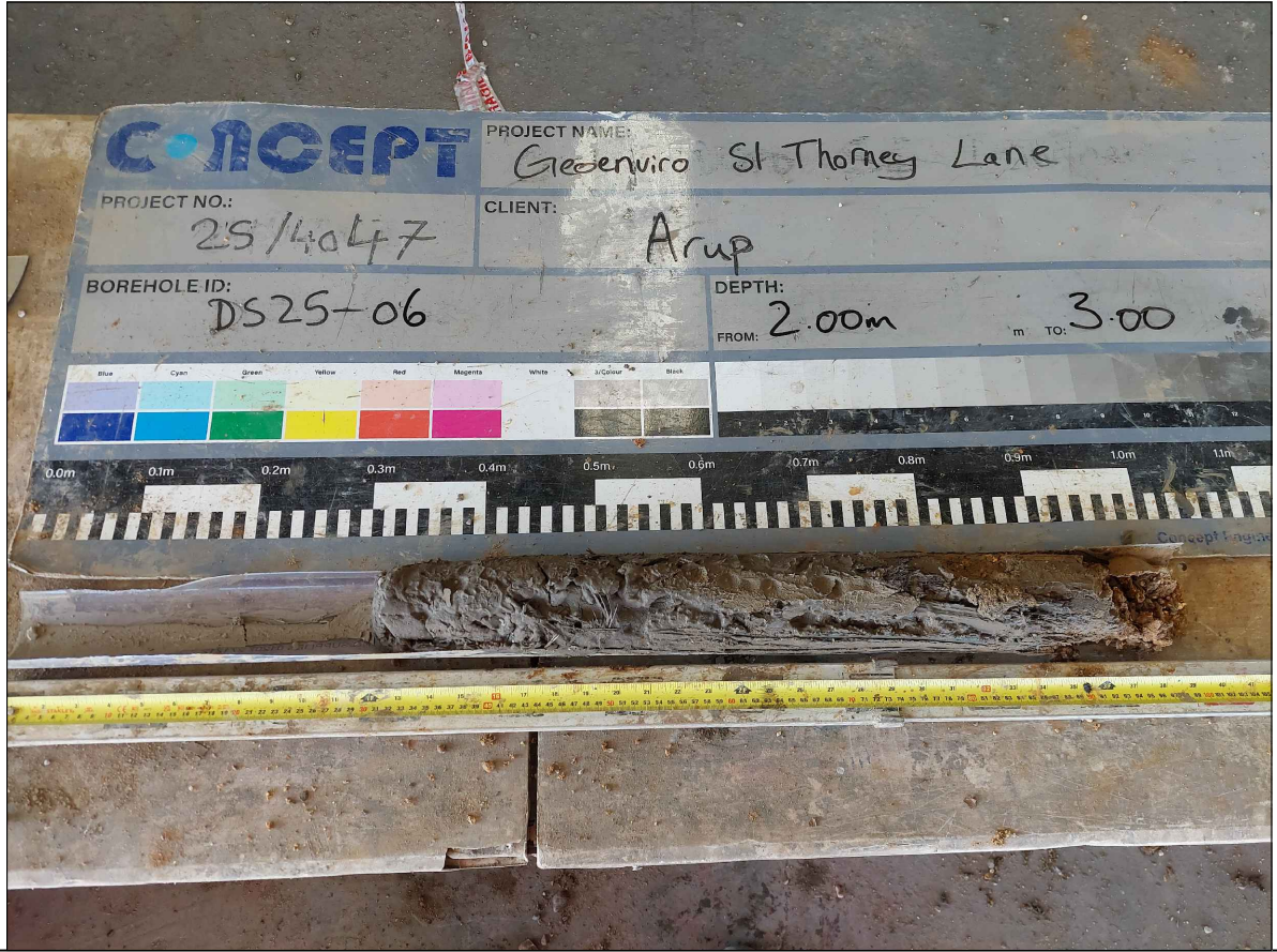
Photograph No 060