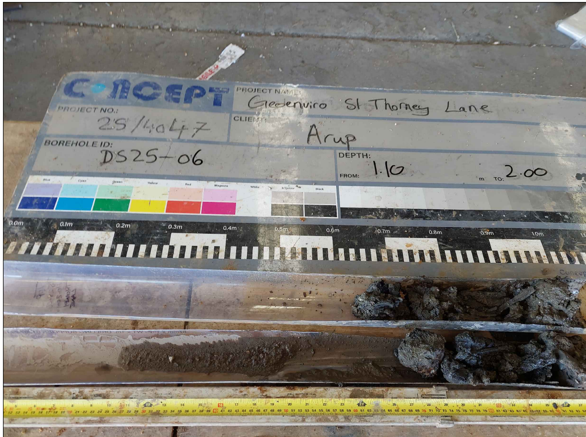
Photograph No 059