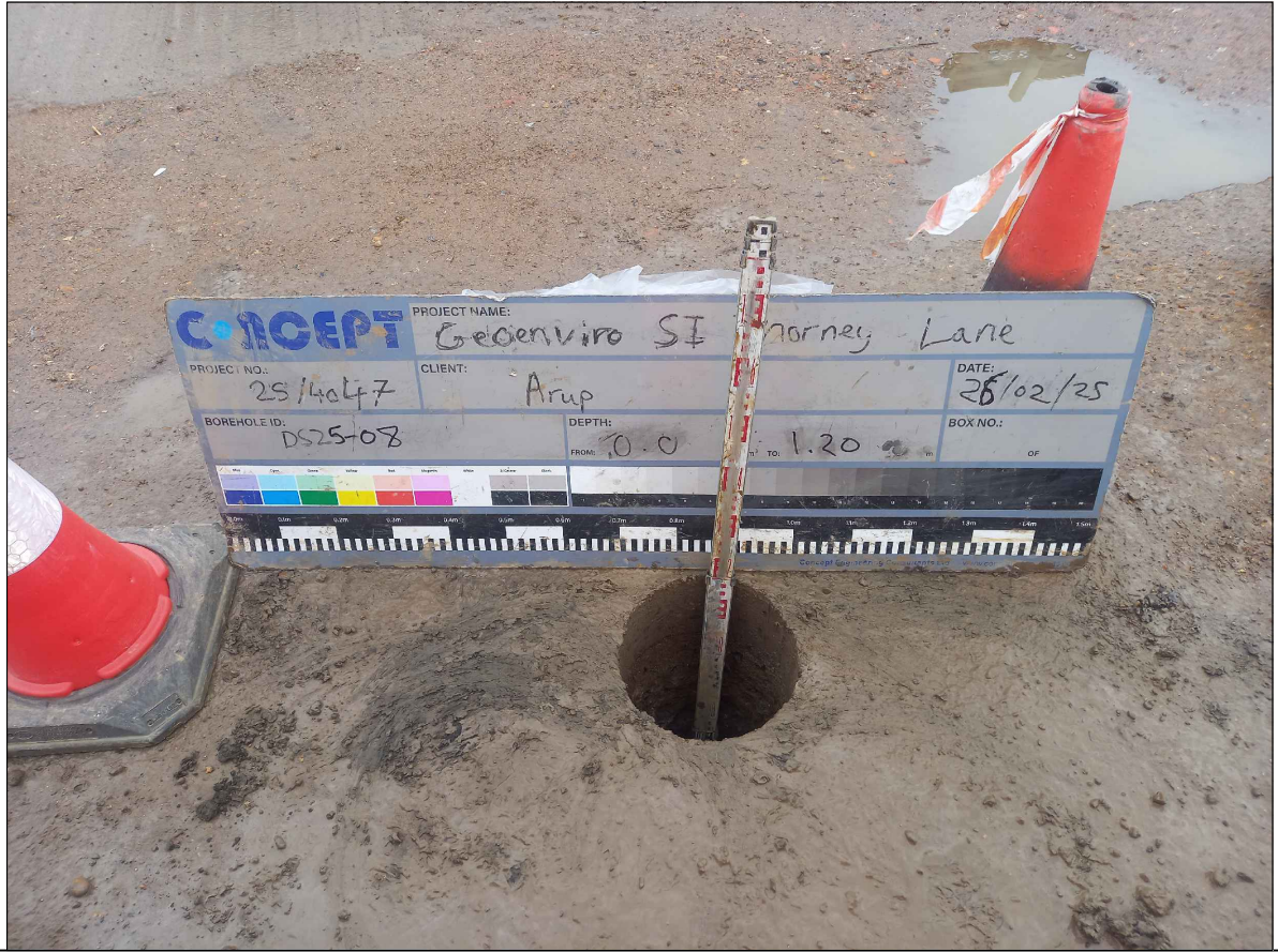
Photograph No 076