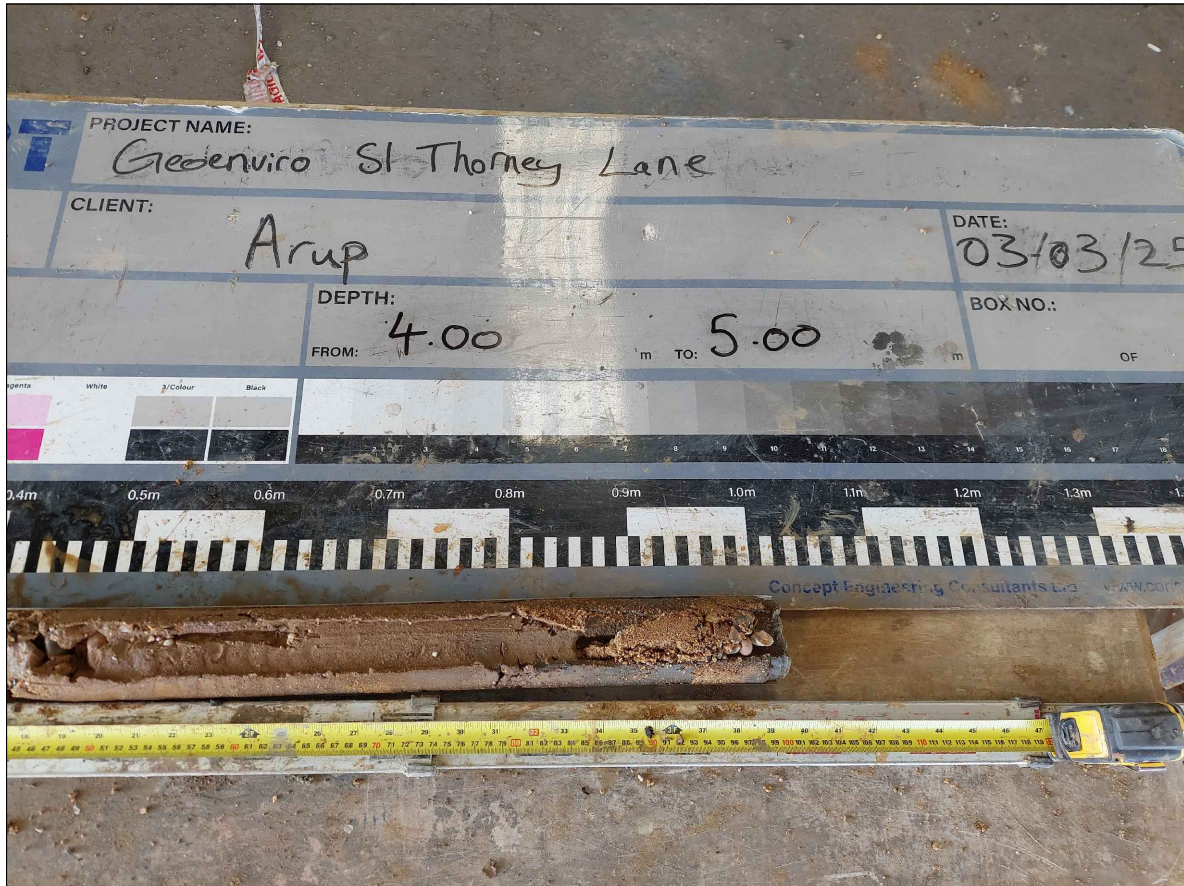
Photograph No 066

MIDLANDS OFFICE: Unit D Herold Way Briery Hill Estate Coventry CV3 2SD coventry@conceptconsultants.co.uk +44(0) 24 7708 7070