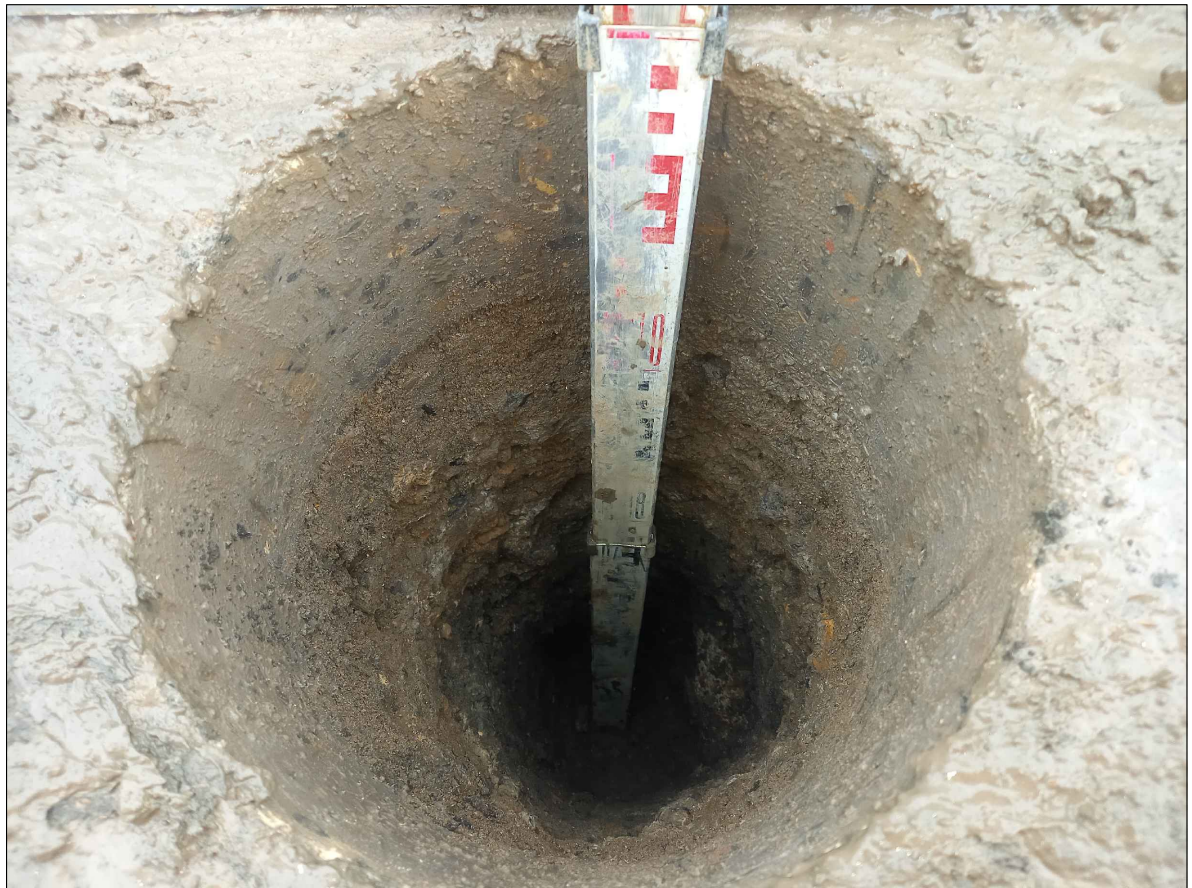
Photograph No 077