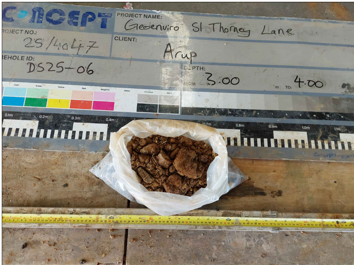
Photograph No 062

MIDLANDS OFFICE: Unit D Herold Way Briery Hill Industrial Estate Coventry CV3 2SD coventry@conceptconsultants.co.uk +44(0) 24 7700 7070