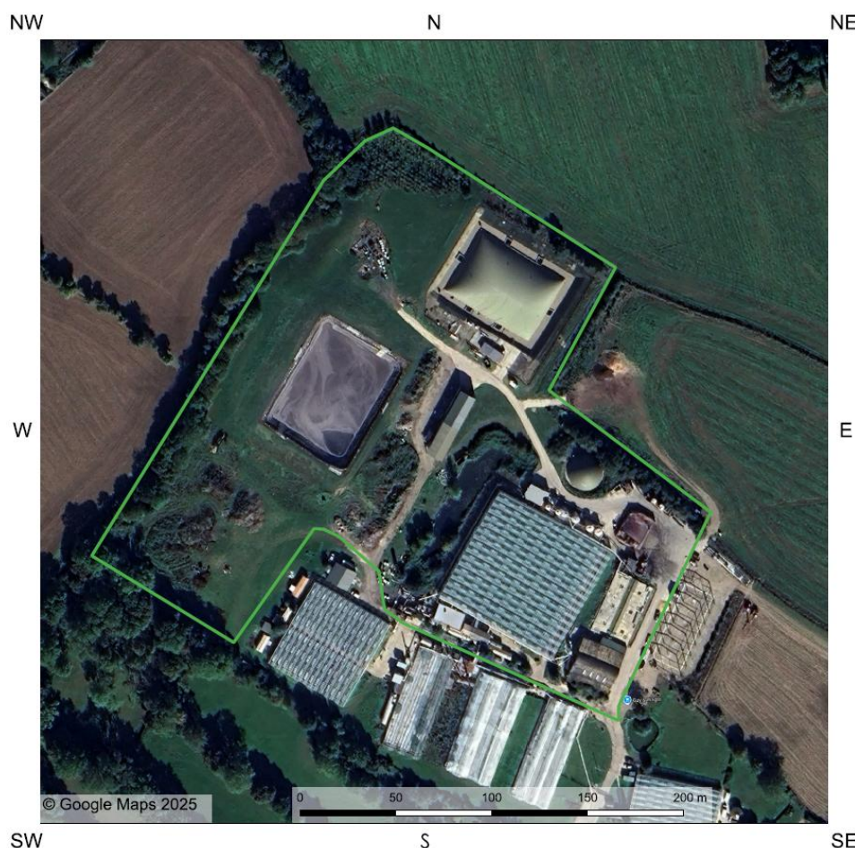
Figure 1 Aerial image of the site, showing the permit boundary in green