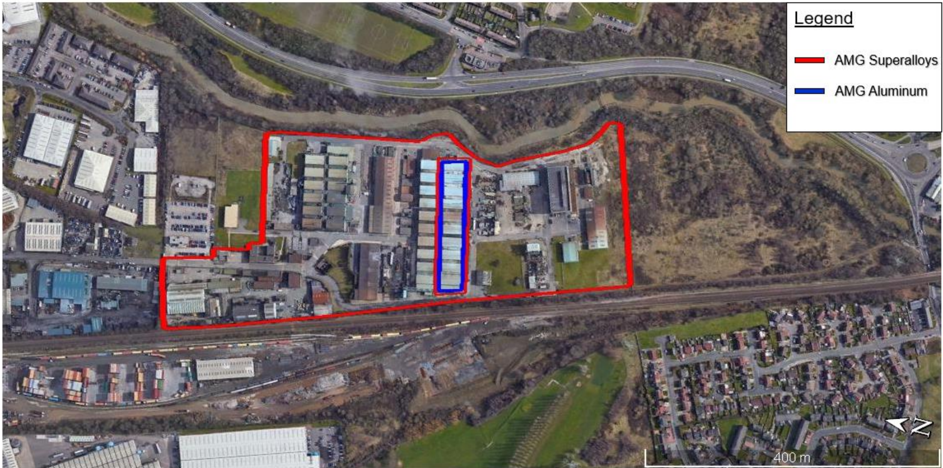
Figure 2 Installation boundary