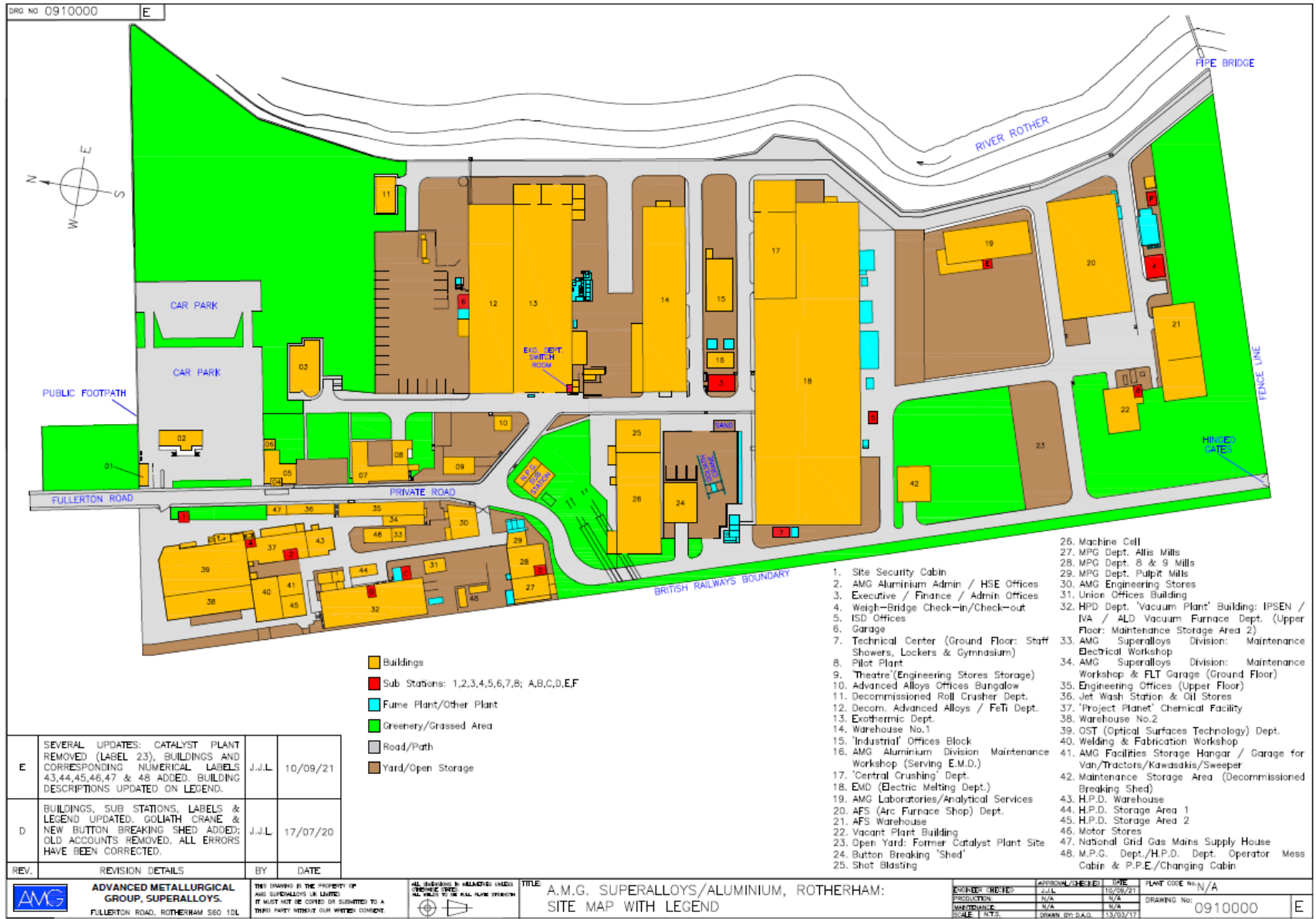
Figure 3 Site activities and surfacing