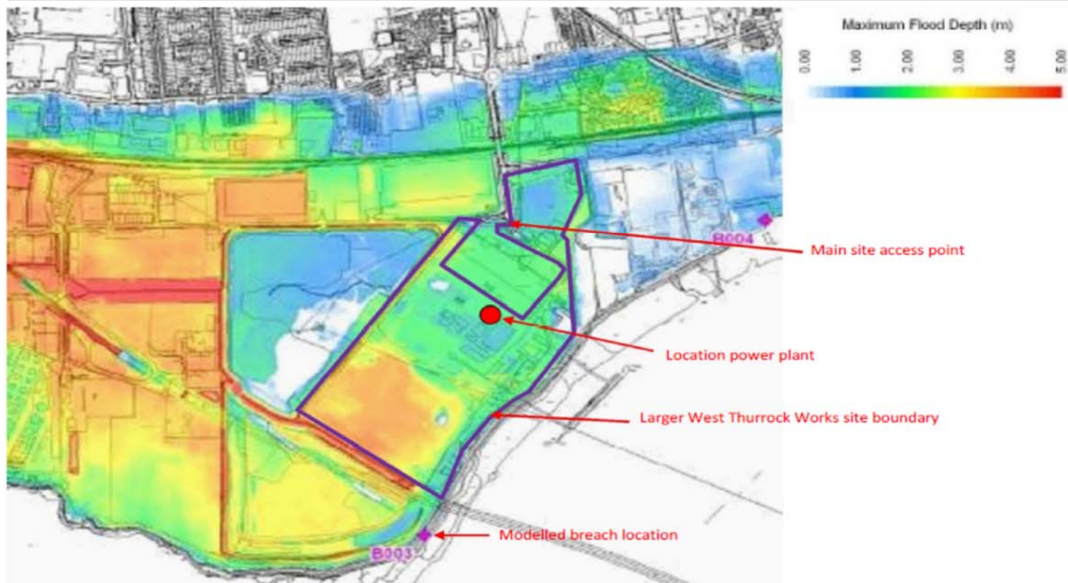
Map 1: Area that will be flooded during the Extreme Event of the 1:1000 Year Tidal Flood (plus Climate Change) if there is a breach in the Thames Tidal Flood Defences. Colours show varying floodwater depths.

Flood Response Plan and Evacuation Procedure