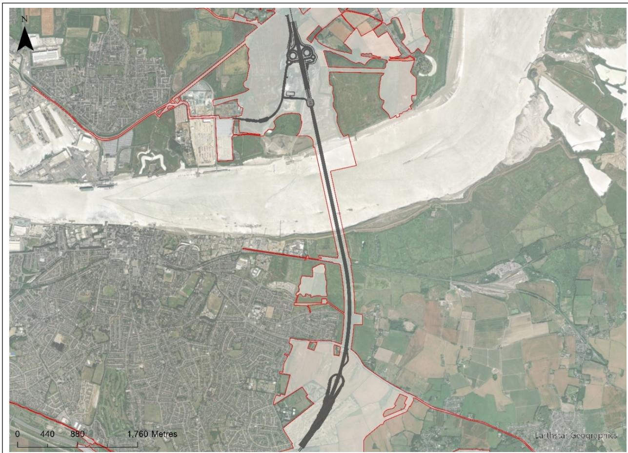
Figure 1-1 Tunnels and Approaches package