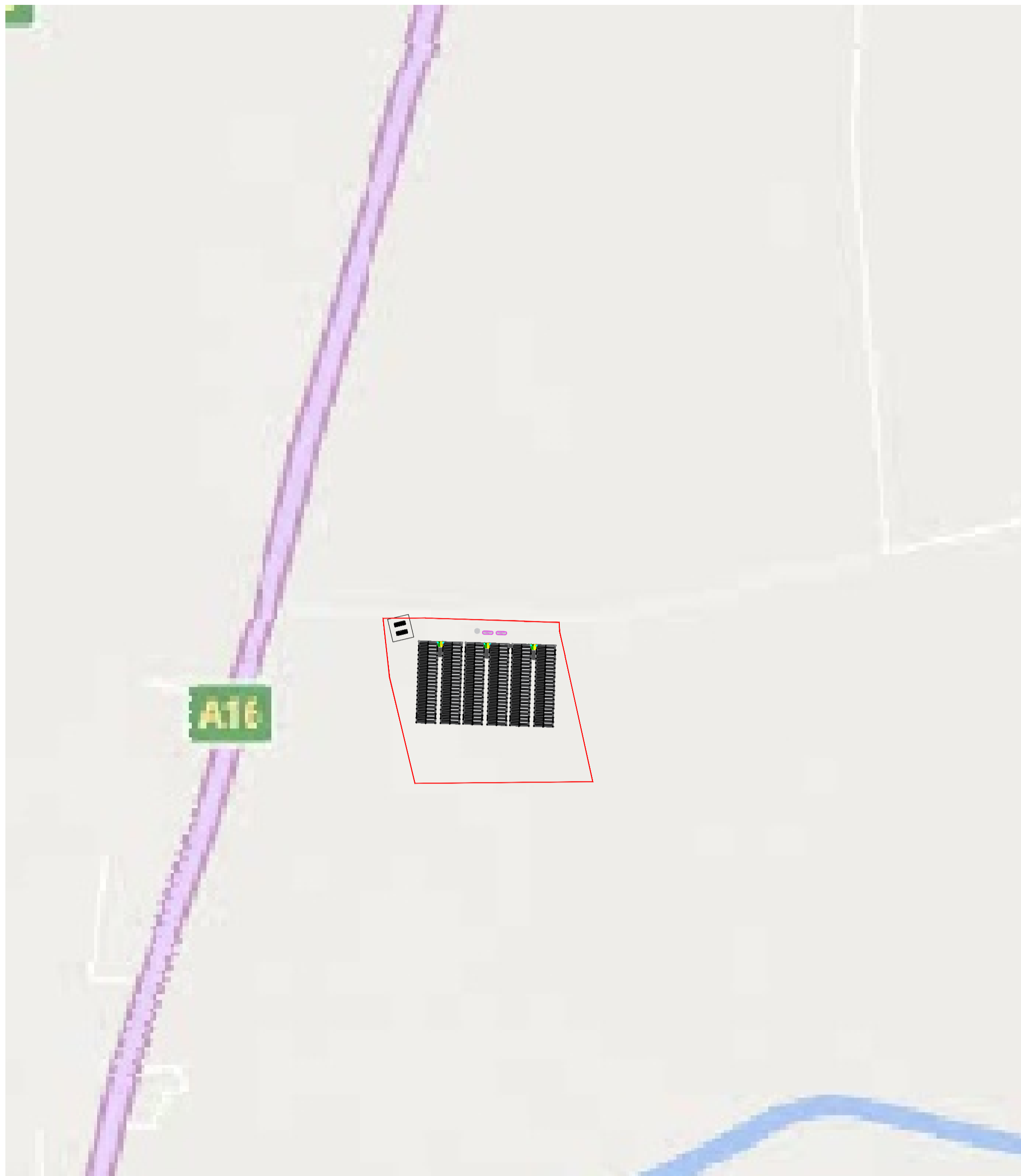
SITE LOCATION Scale 1:5000 @ A1 BOUNDARY LINE