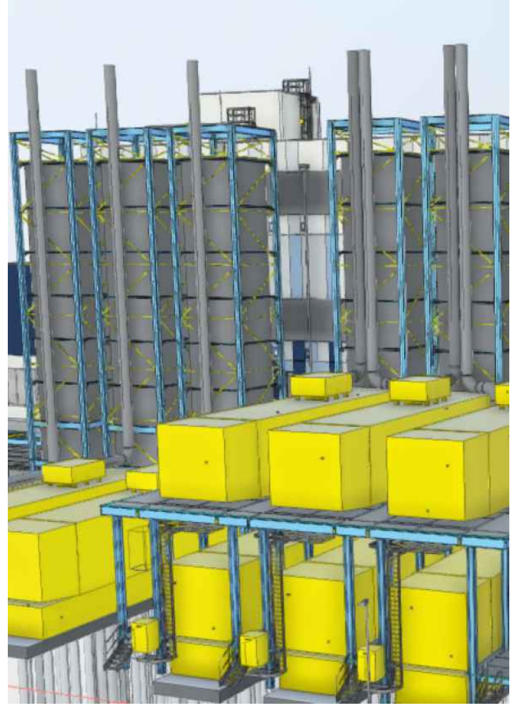
VIEW OF TYPICAL SINGLE / DOUBLE STACK GENERATORS AND ASSOCIATED EXHAUST FLUES