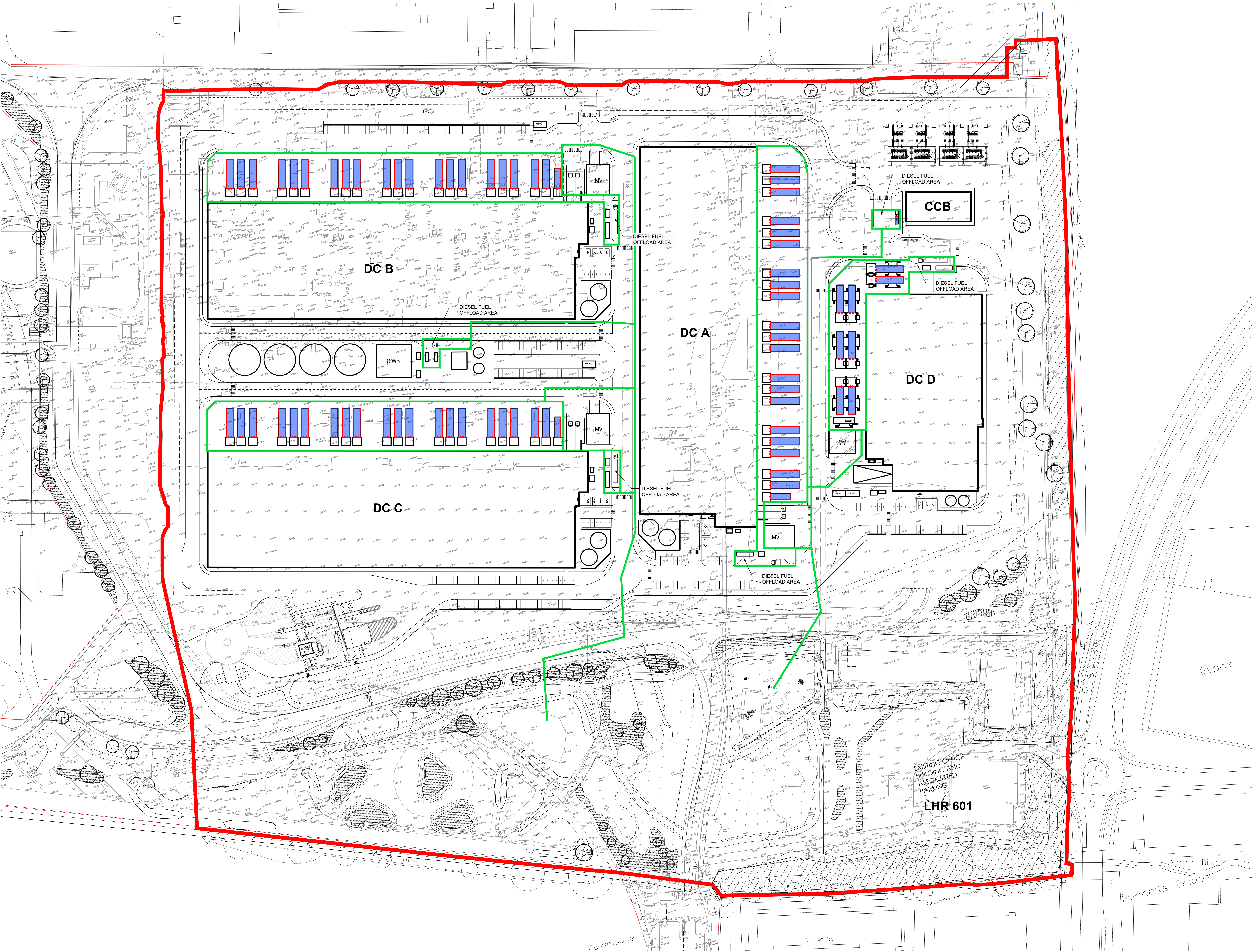
PERMITTING PLAN 1:750

DRAWING CREATED USING REVIT - MODEL NUMBER: LHR108-RPS-00-DR-A-SK0015 BASED ON TEMPLATE VERSION: 820-24H-0PTDC-2-4 PDF PRINT DATE: 16/04/2025 16:56:40