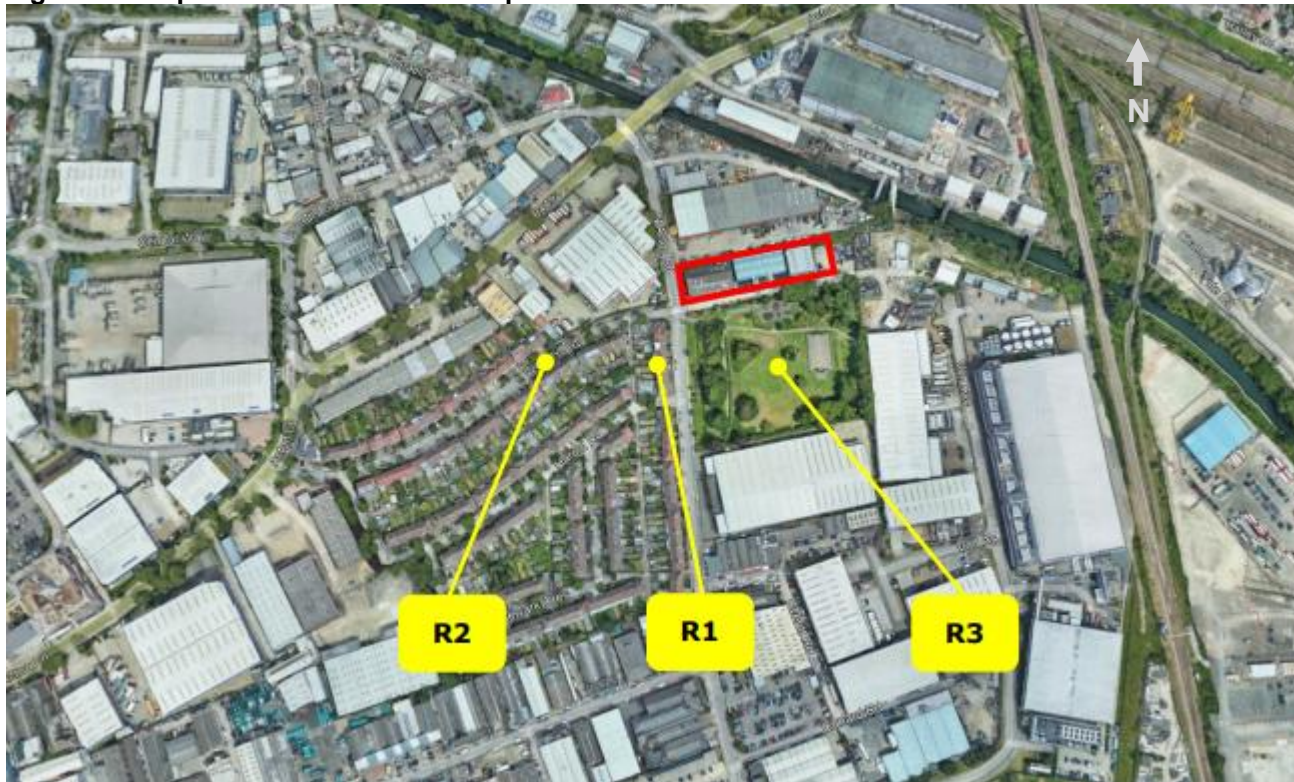
Figure 2.1 Map of site location and receptors