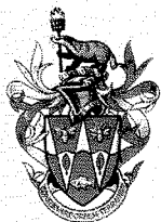
CIWM Chief Executive Officer

The Chartered Institution of Wastes Management