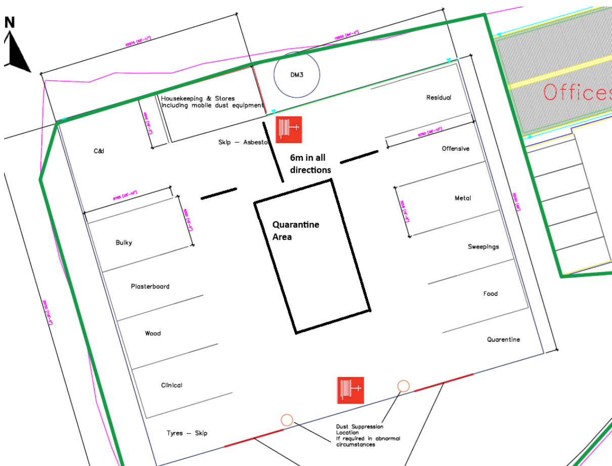
Figure 3 - quarantine area

The quarantine area be located on an area which will benefit from impermeable surfacing and a sealed drainage system and will be large enough to hold at least 50% of the largest combustible stockpile on site, whilst maintaining a 6m separation distance from other combustible materials, and buildings.