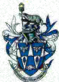
CIWM Chief Executive Officer

The Chartered Institution of Wastes Management