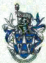
CIWM Chief Executive Officer

The Chartered Institution of Wastes Management