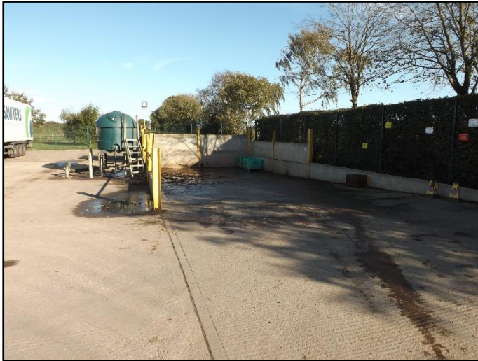
Figure B.1: Truck-Wash Sump