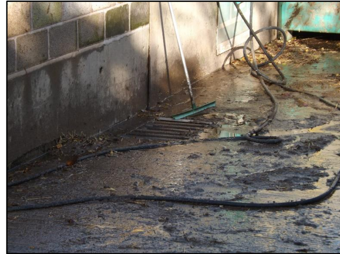
Figure B.2: Truck-Wash Sump – Internal Drain