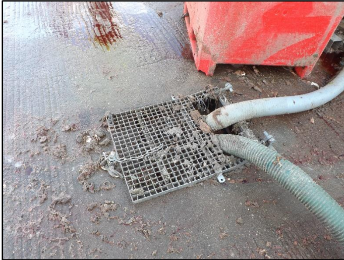
Figure B.5: Effluent Sump – Outlet