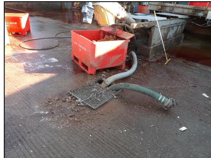
Figure B.4: Effluent Sump