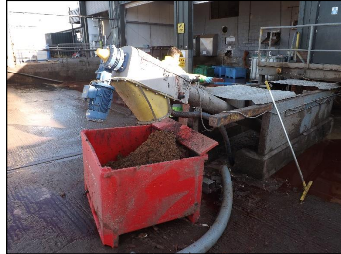
Figure B.6: Effluent Sump – Solids Screw Screen