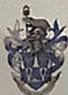
CIWM Chief Executive Officer

The Chartered Institution of Wastes Management