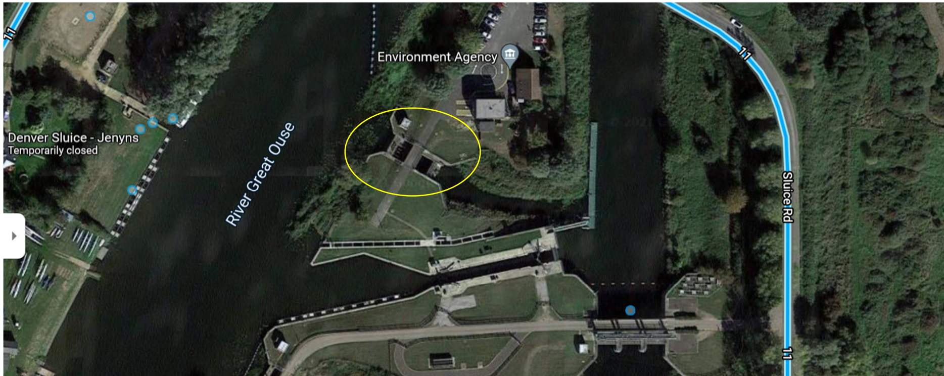
Figure 1: Residual Flow Sluice – Denver Complex