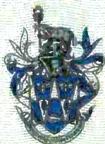
CIWM Chief Executive Officer

The Chartered Institution of Wastes Management