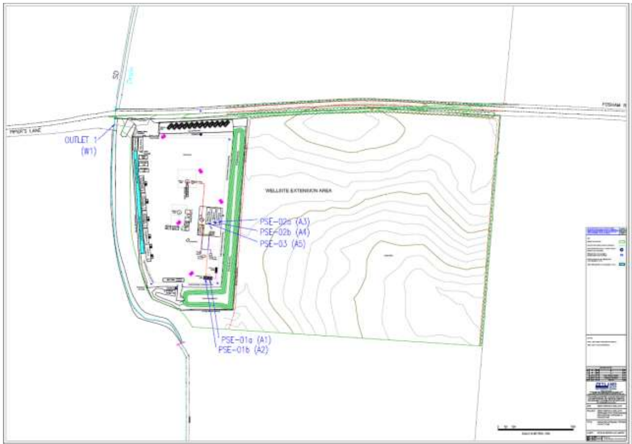
Figure 2: Indicative layout – appraisal/ testing layout with air emission points (PSE)